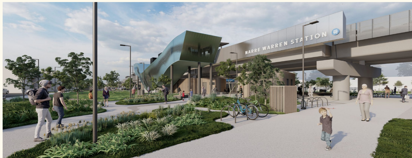
Southeast view of the new Narre Warren Station and landscaped forecourt. Artist impression, subject to change.

The existing bridge will remain to provide important maintenance access to the rail track.