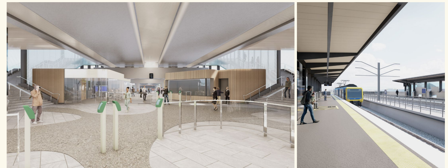
Station concourse and elevated platforms. Artist impression subject to change.