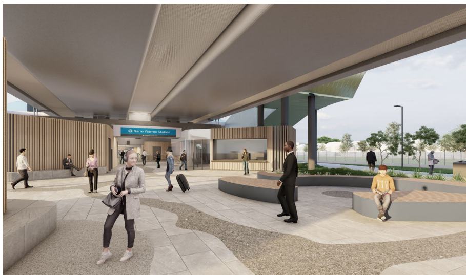
Sheltered seating area under the rail bridge. Artists impression, subject to change.

You can read the complete community consultation report at levelcrossings.vic.gov.au/webb-street