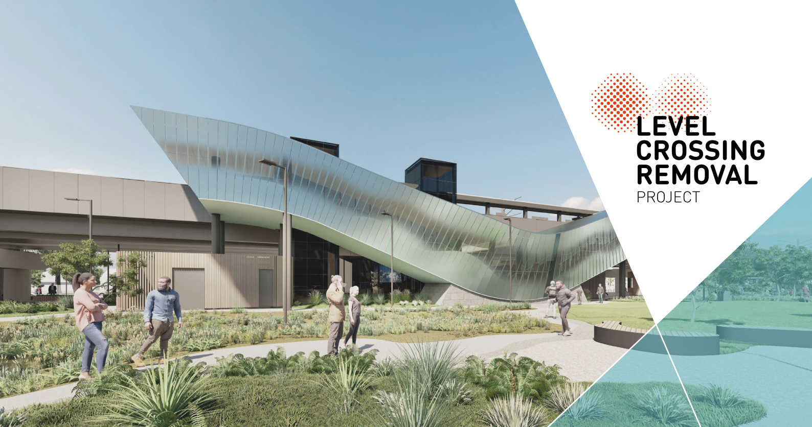
Southwest view of Narre Warren Station staircase and forecourt. Artist impression, subject to change.