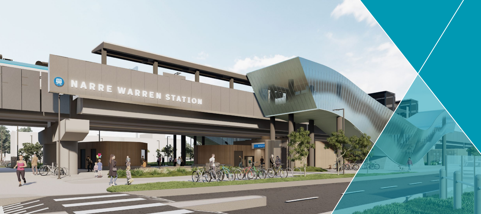
Northeast view of Narre Warren Station. Artist impression, subject to change.