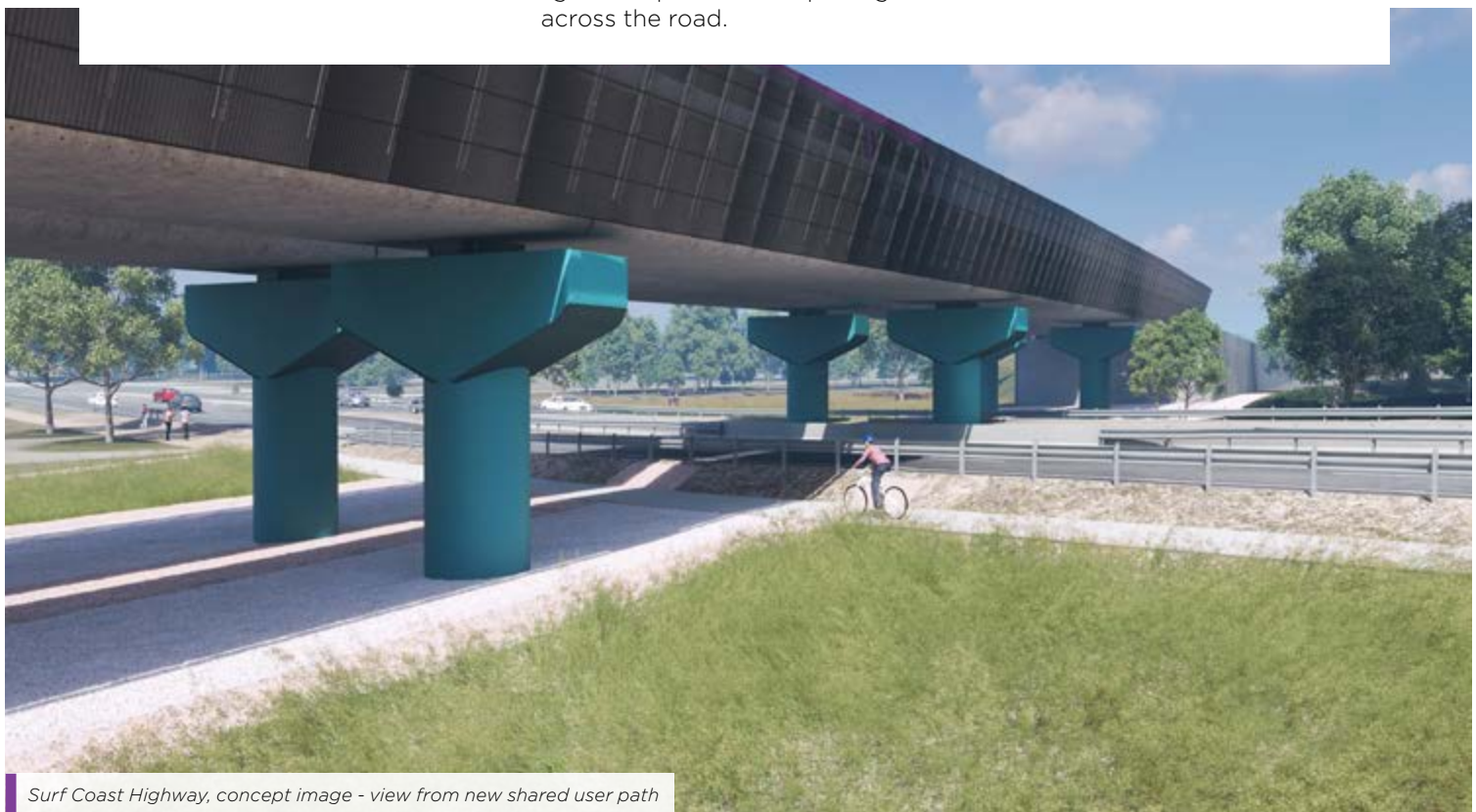
Surf Coast Highway, concept image - view from new shared user path

There will also be a new local path along the old rail line, to connect Bickford Road to the existing footpath on the eastern side of Surf Coast Highway.