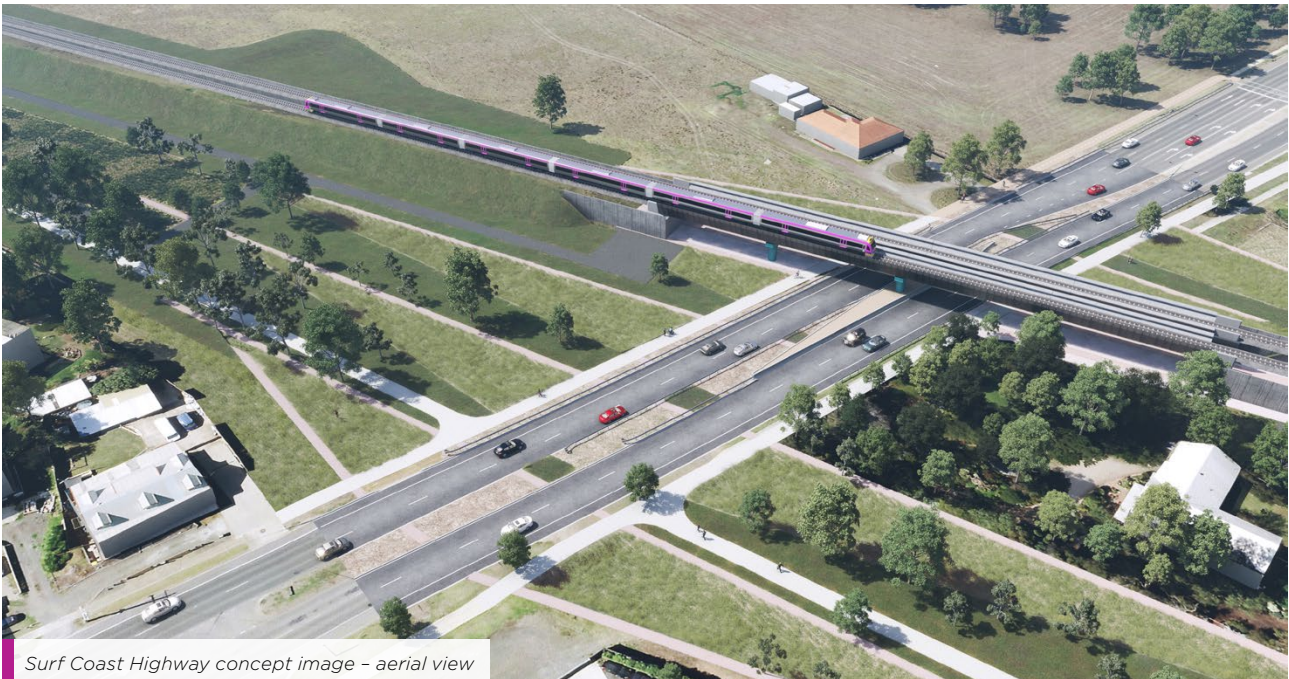
Surf Coast Highway concept image - aerial view

We will undertake a staged approach to constructing the project, so that we can carry out works safely and minimise disruption as much as possible.