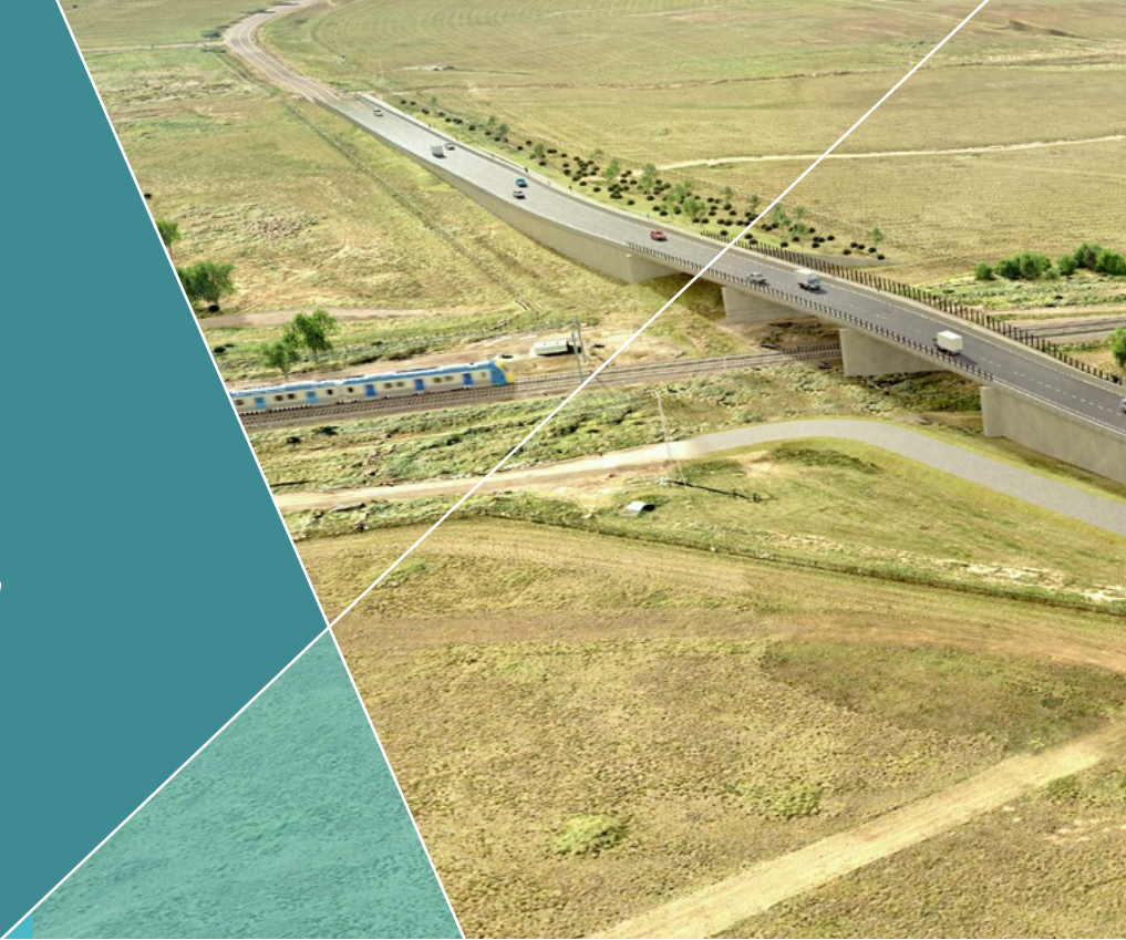
Artist impression only, subject to change

The Victorian Government is removing six dangerous and congested level crossings on the Sunbury Line and delivering the Sunbury Line Upgrade as part of an investment to improve safety, reduce congestion and run more trains, more often.