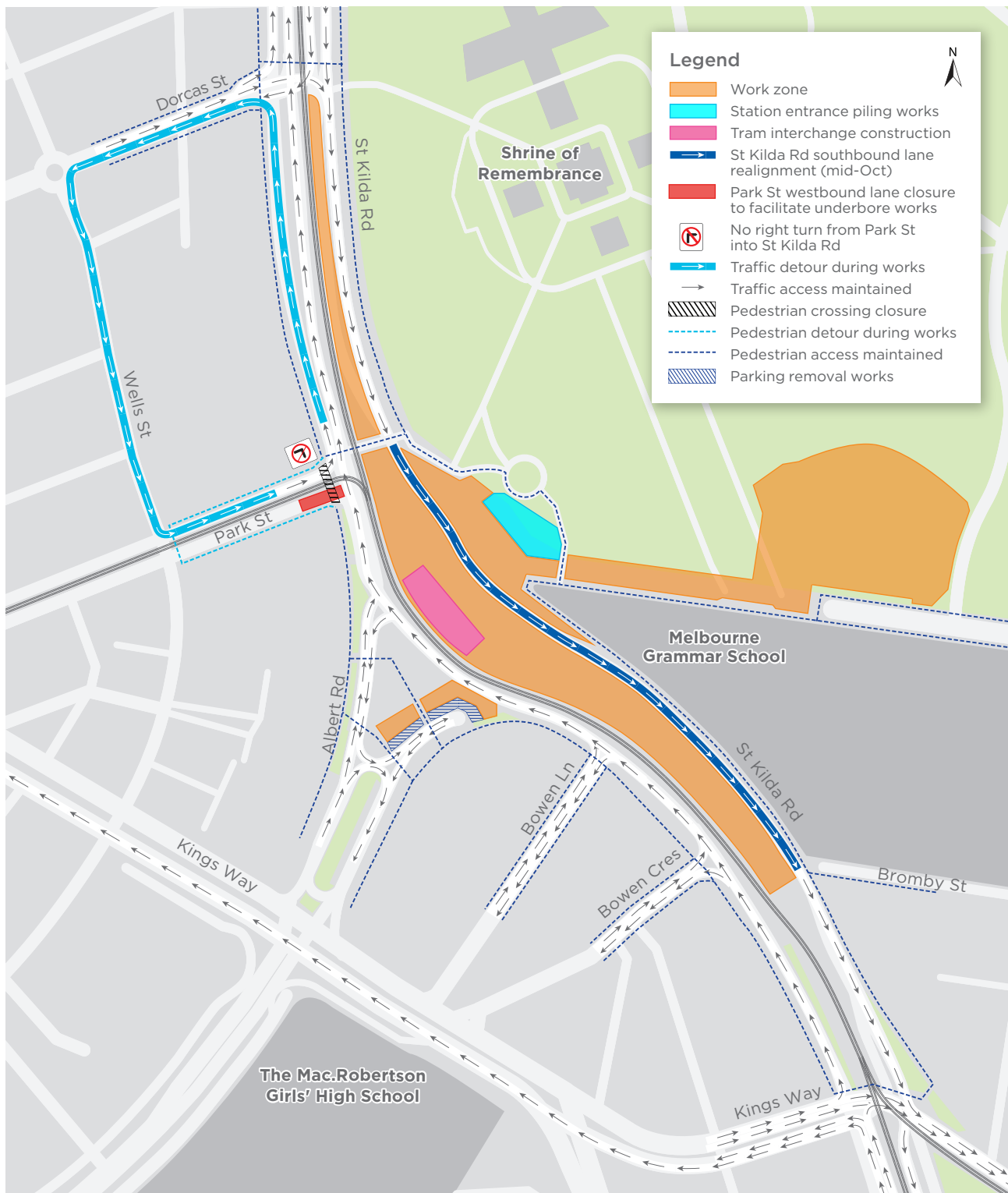
Anzac Station Construction Works - Indicative only