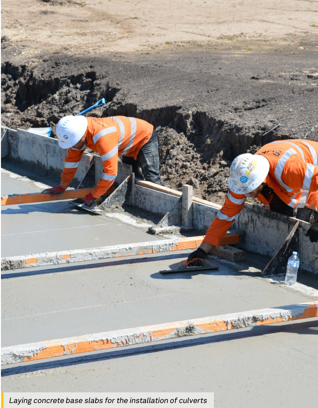
Laying concrete base slabs for the installation of culverts

For more information about the project please call 1800 105 105 or email contact@roadprojects.vic.gov.au . You can now also sign up for email and SMS updates by visiting roadprojects.vic.gov.au/healesville-kwr