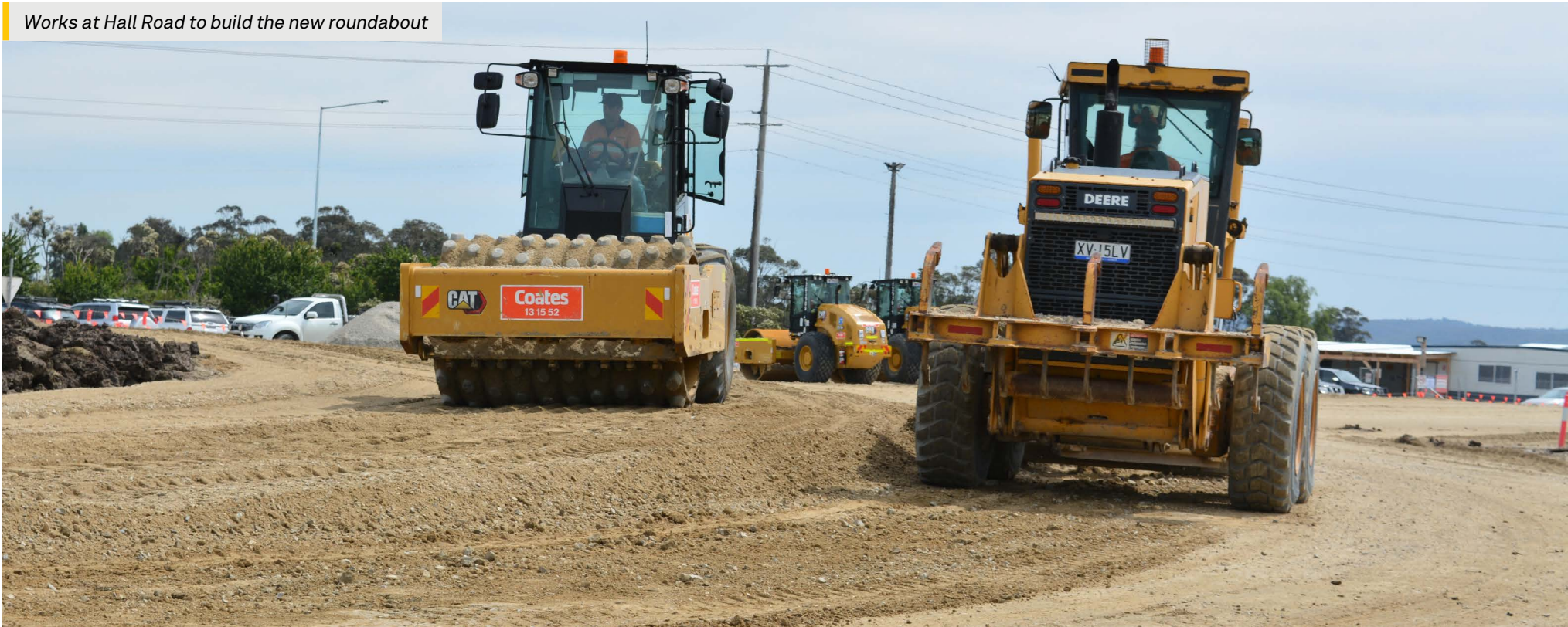
Works at Hall Road to build the new roundabout