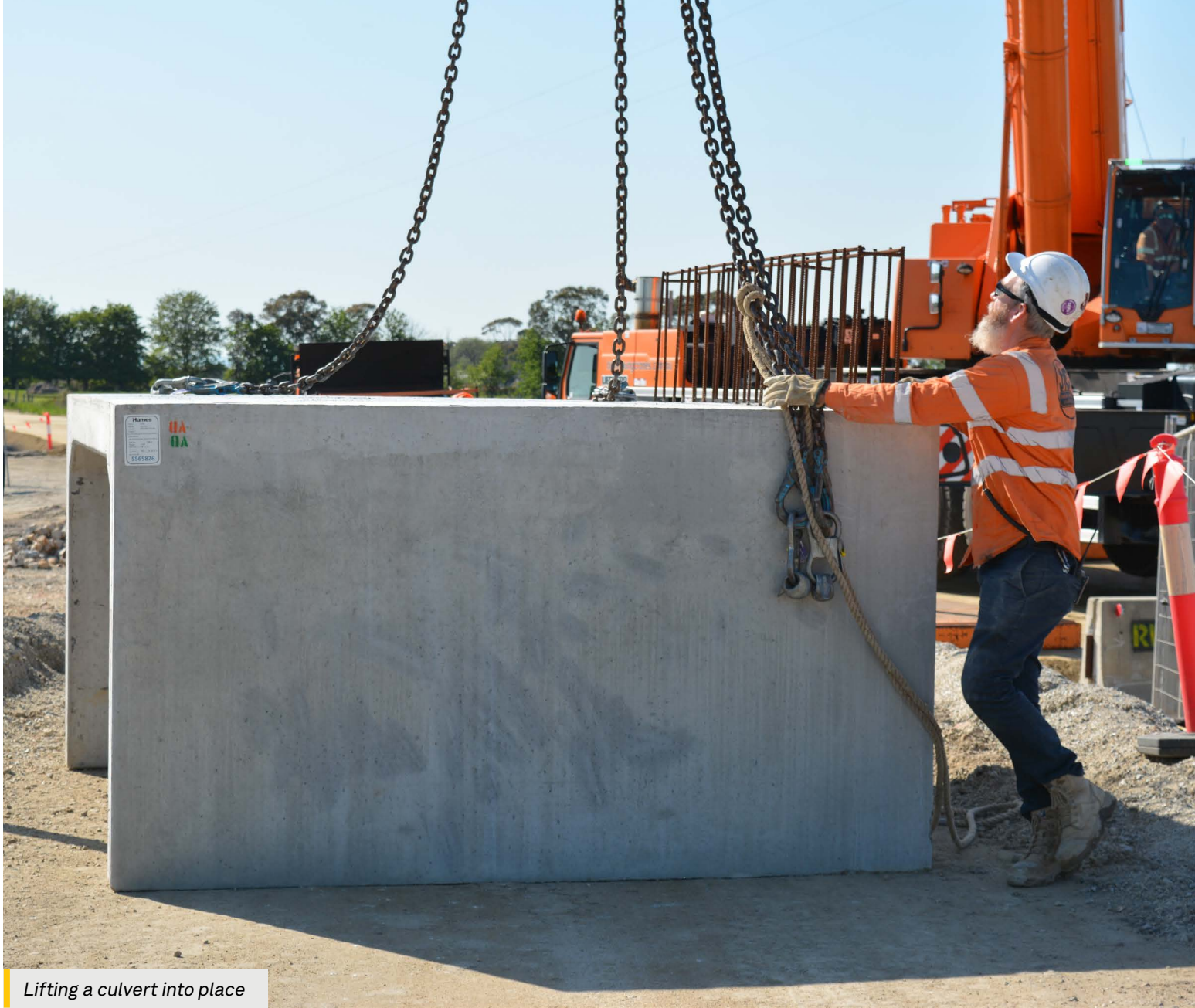
Lifting a culvert into place