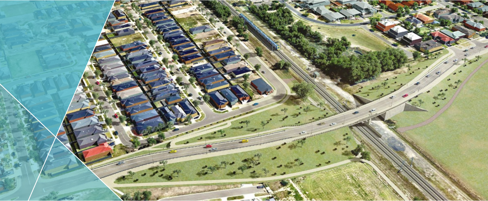
Artist impression only, subject to change