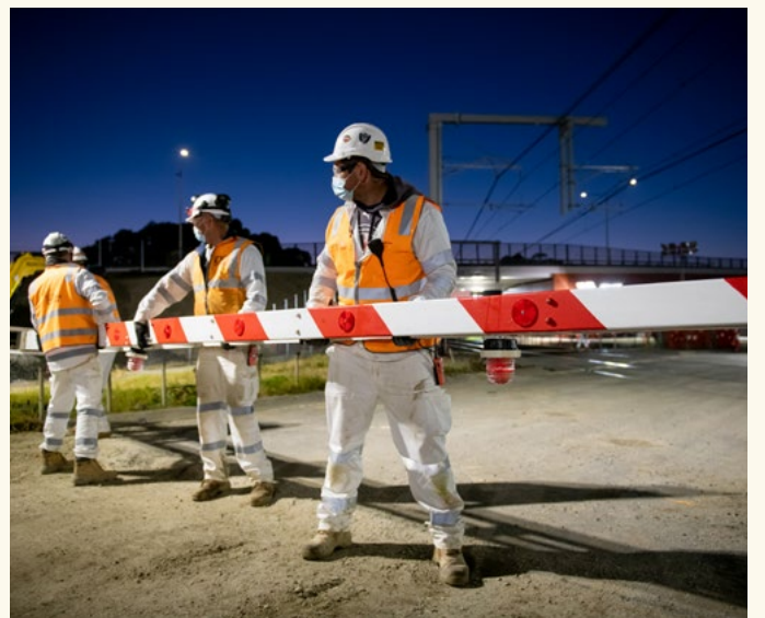
Boom gate removal at South Gippsland Highway