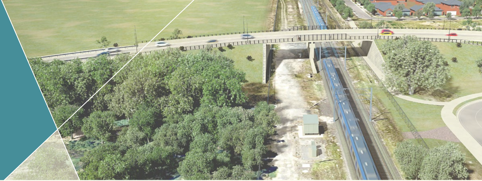
Artist impression only, subject to change