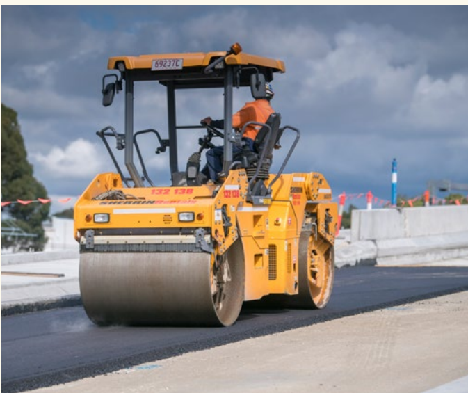
Asphalt is tamped on the South Gippsland Highway road bridge