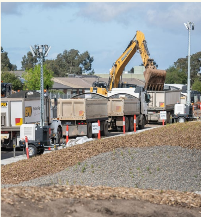
Earthworks at Robinsons Road