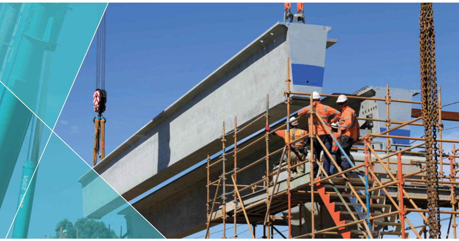
artist impressions only

The Victorian Government is removing the dangerous and congested level crossings at Bell Street, Reynard Street and Munro Street in Coburg, and Moreland Road in Brunswick.