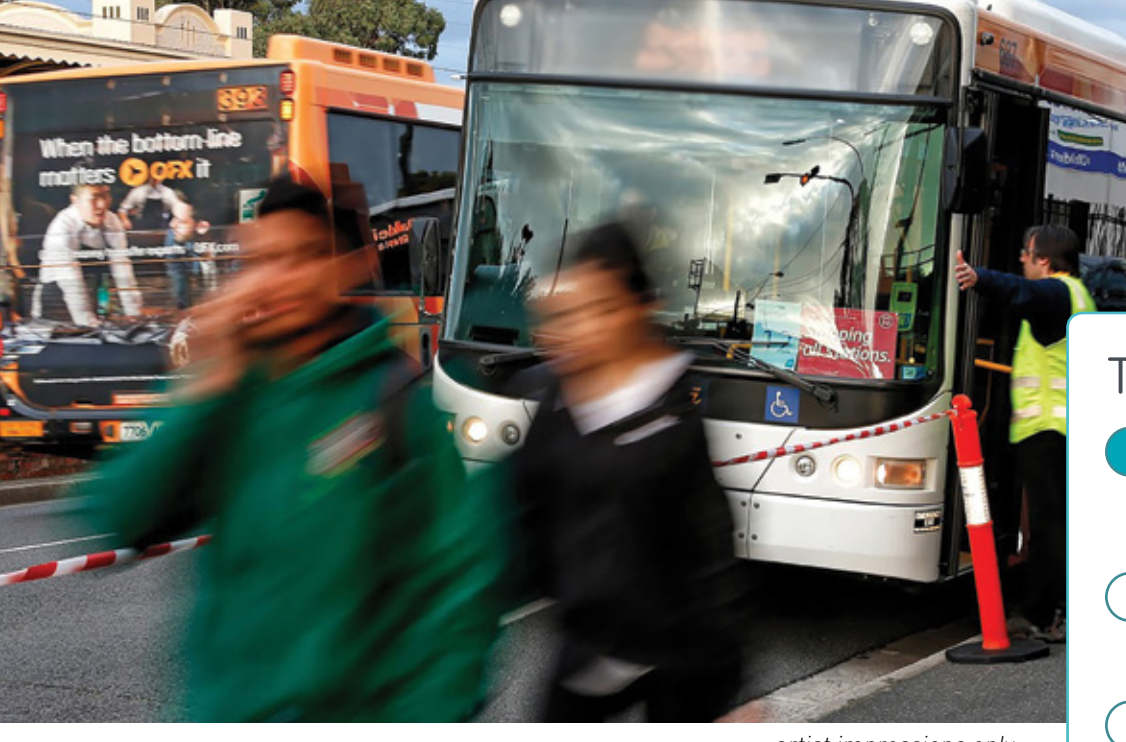
artist impressions only