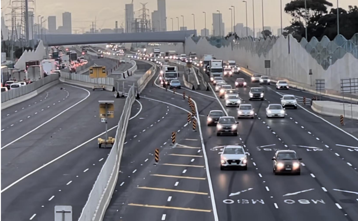
WGF Stage 5 Traffic Switch Outbound approach Grieve Pde