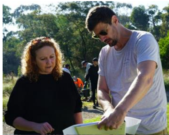
Friends of Newport Lakes