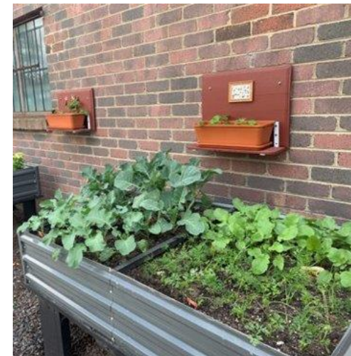
Yarraville Community Centre gardens