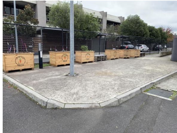
Laverton Bowls Club