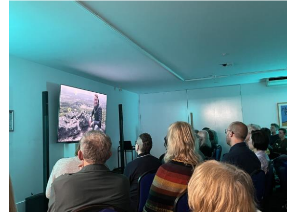
Yarra Riverkeeper Association