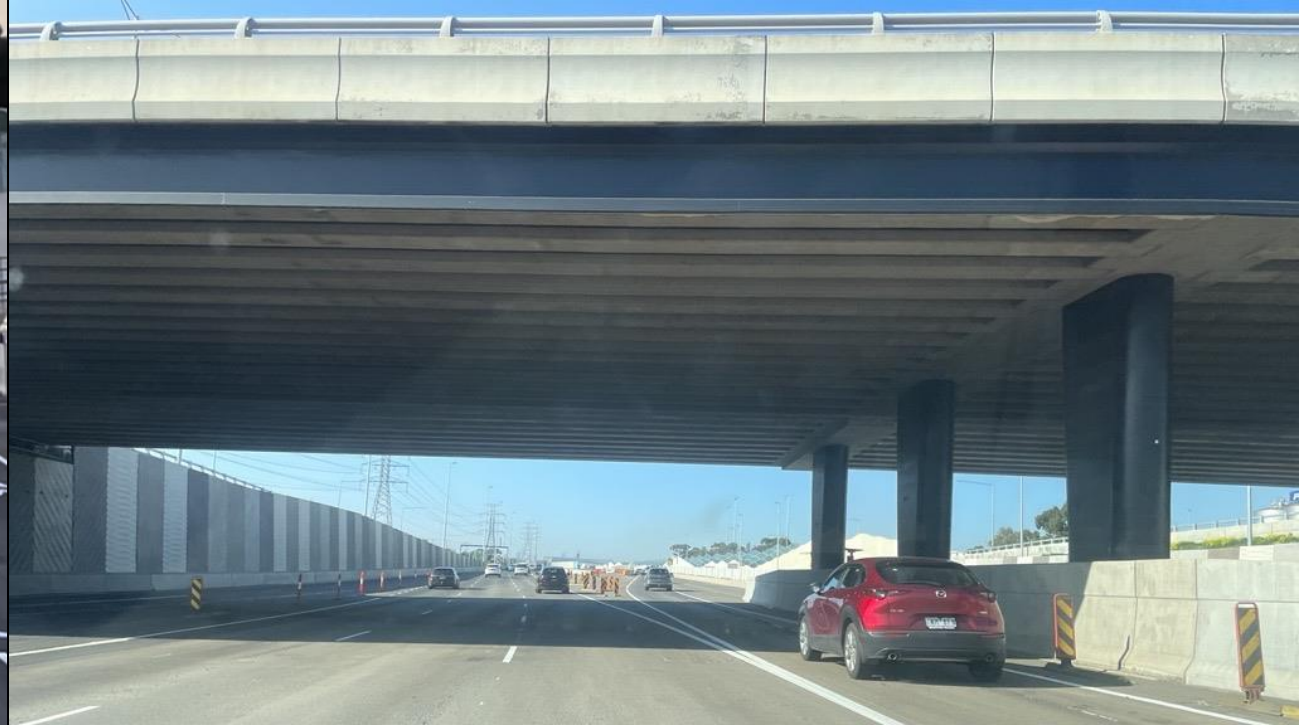
WGF Stage 5 Traffic Switch Inbound under Grieve Pde