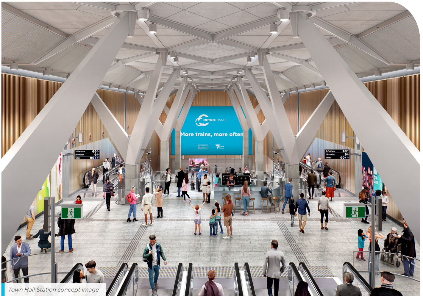
Town Hall Station concept image