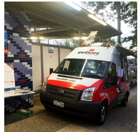
Station coffee morning

We realise that construction is disruptive to the community and we aim to minimise impact as much as possible. We thank you for your understanding and patience so far as we remove the level crossing and build a new station at Heatherdale Road.