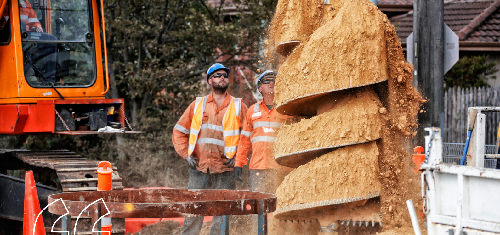
Piling works at Heatherdale Road level crossing, Saturday 19 March 2016.