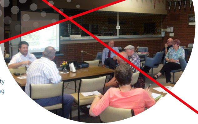
Heatherdale Community Action Group meeting

More details will be available closer to the time.