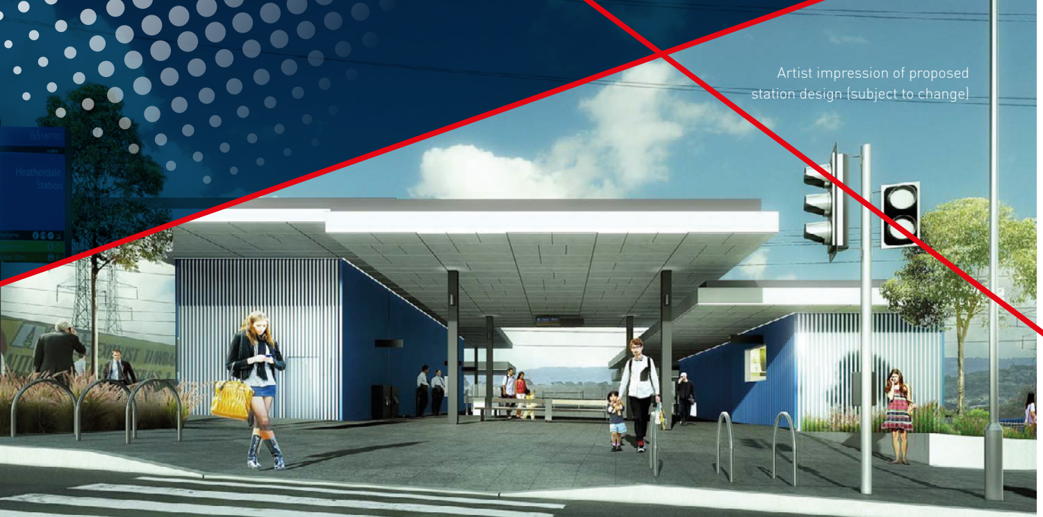
Artist impression of proposed station design (subject to change)