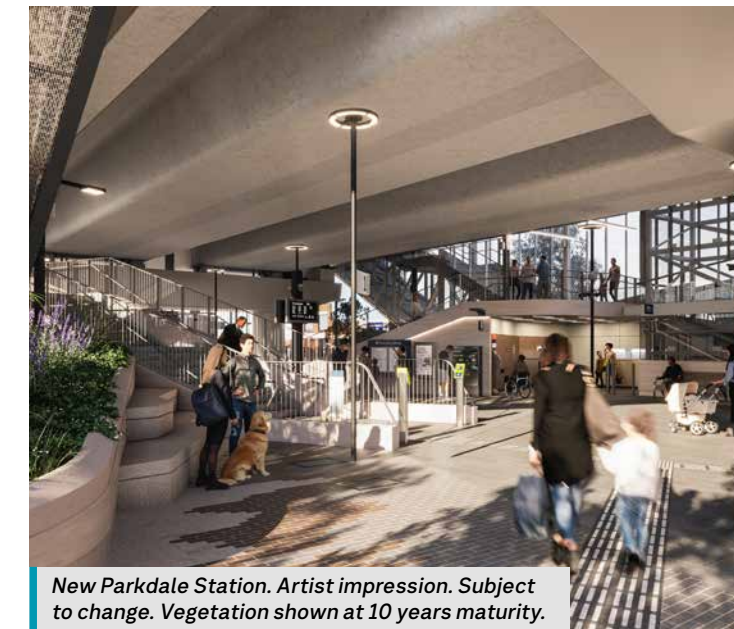
New Parkdale Station. Artist impression. Subject to change. Vegetation shown at 10 years maturity.