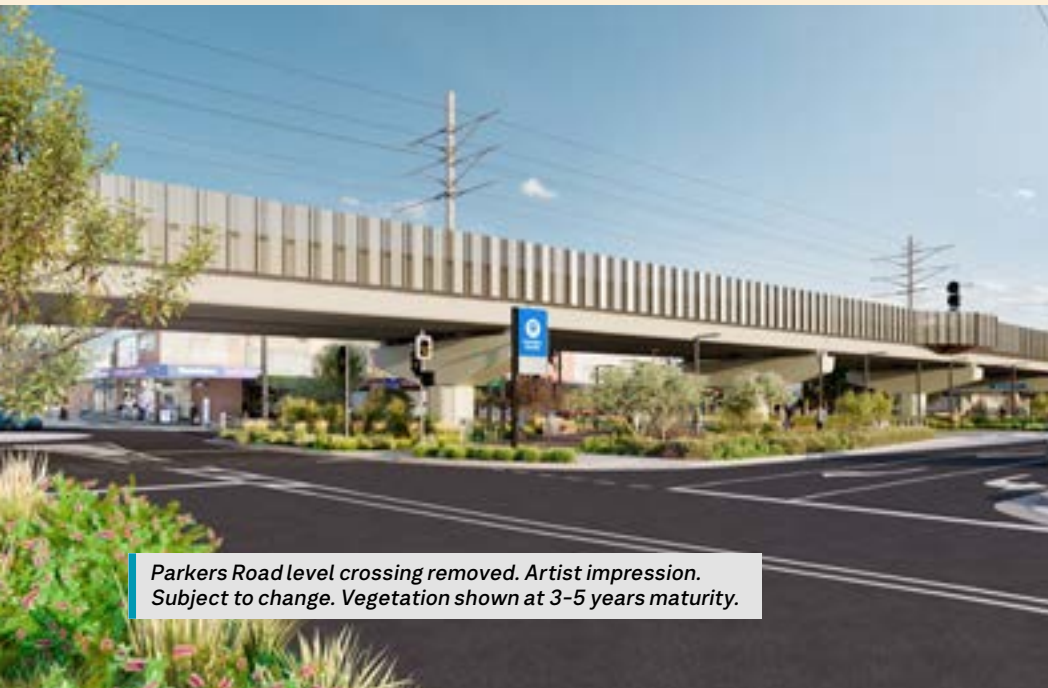
Parkers Road level crossing removed. Artist impression. Subject to change. Vegetation shown at 3-5 years maturity.