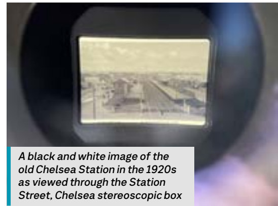
A black and white image of the old Chelsea Station in the 1920s as viewed through the Station Street, Chelsea stereoscopic box

The central rail bridge design allows us to plant more trees and greenery on both sides of the elevated rail line, providing screening of the rail bridge along both Como Parade East and West.