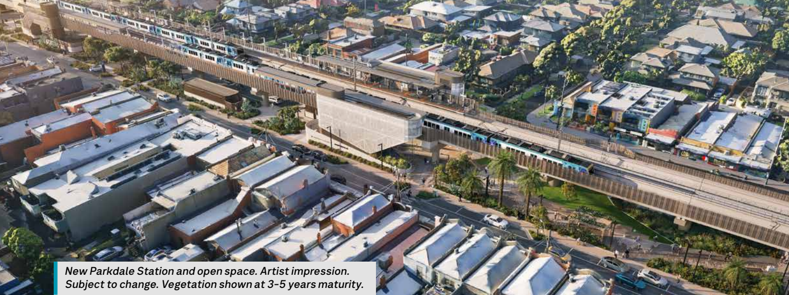
New Parkdale Station and open space. Artist impression. Subject to change. Vegetation shown at 3-5 years maturity.