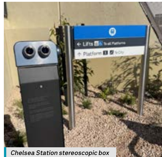
Chelsea Station stereoscopic box

The old station building will be celebrated by the installation of an image viewer, or stereoscopic box, showing an image of the former Parkdale Station.