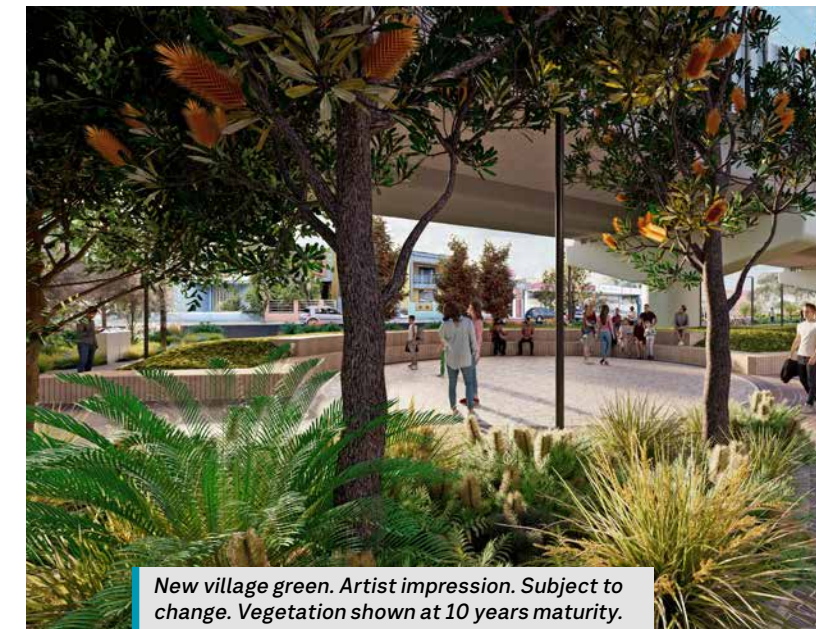
New village green. Artist impression. Subject to change. Vegetation shown at 10 years maturity.

There will be 148 time restricted car spaces near the Parkdale shops.