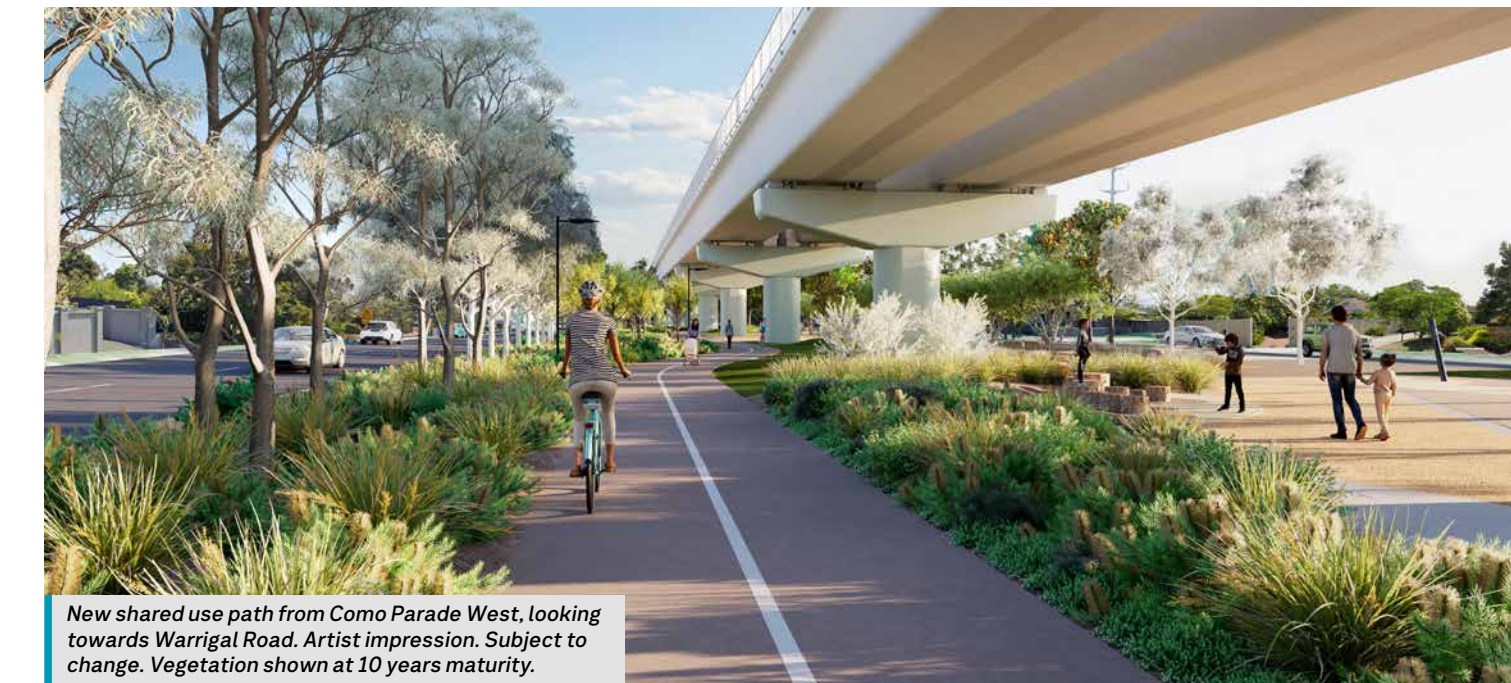
New shared use path from Como Parade West, looking towards Warrigal Road. Artist impression. Subject to change. Vegetation shown at 10 years maturity.

The new station precinct parking will include: