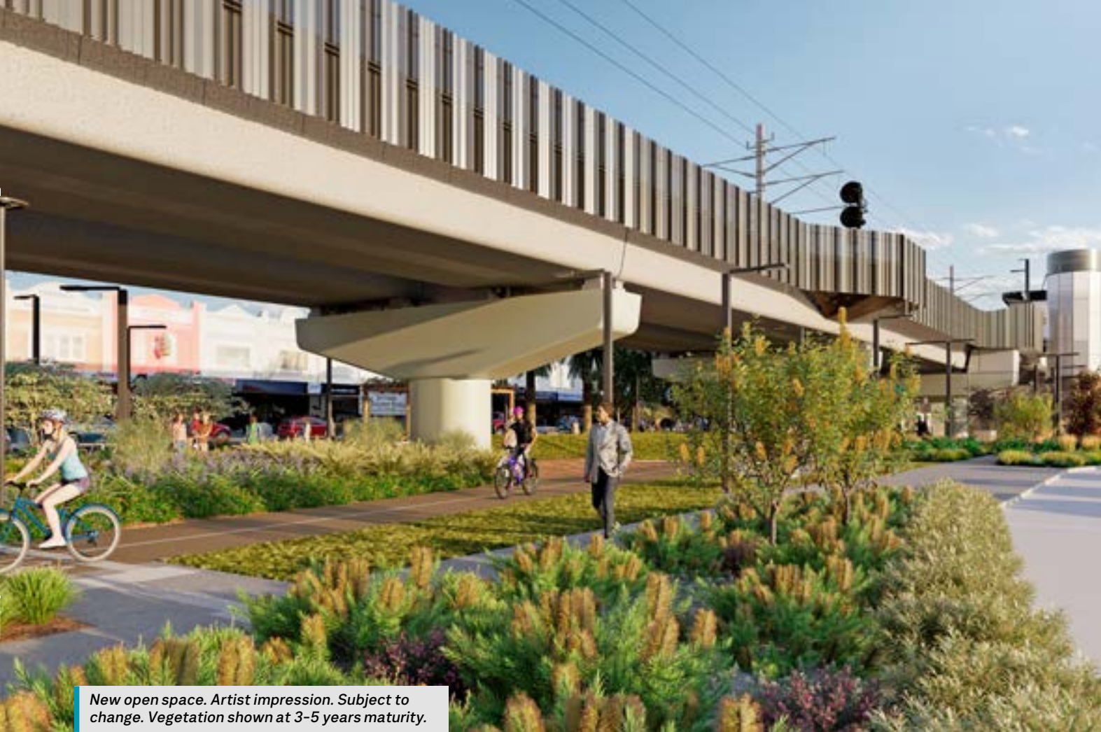
New open space. Artist impression. Subject to change. Vegetation shown at 3-5 years maturity.