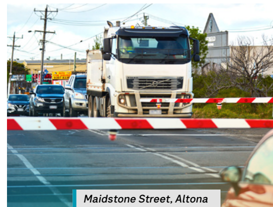
Maidstone Street, Altona

Subscribe for email updates by scanning the QR code or visit levelcrossings.vic.gov.au/subscribe