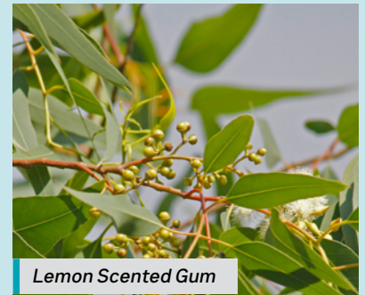
Lemon Scented Gum

Its fast-growing nature and ability to serve as an effective screening tree make it ideal for creating a separation between the Derby Crescent streetscape and the rail corridor.