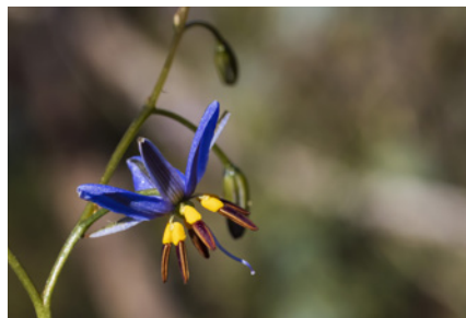
Coast Flax Lily