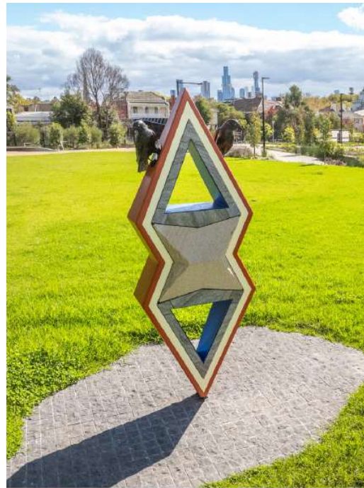
Where We Walk (2023) Kent Morris

Attendees to register their interest via website