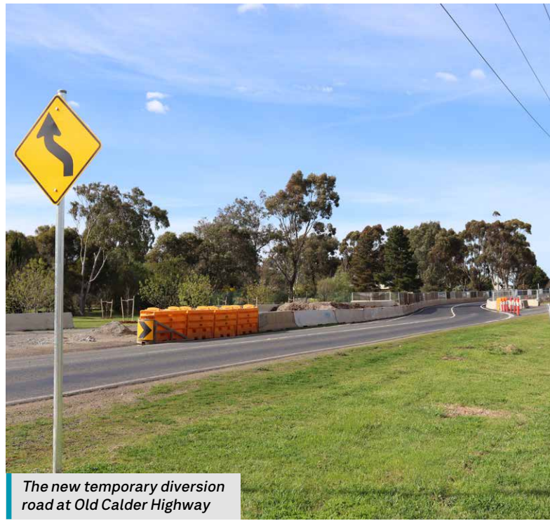
The new temporary diversion road at Old Calder Highway