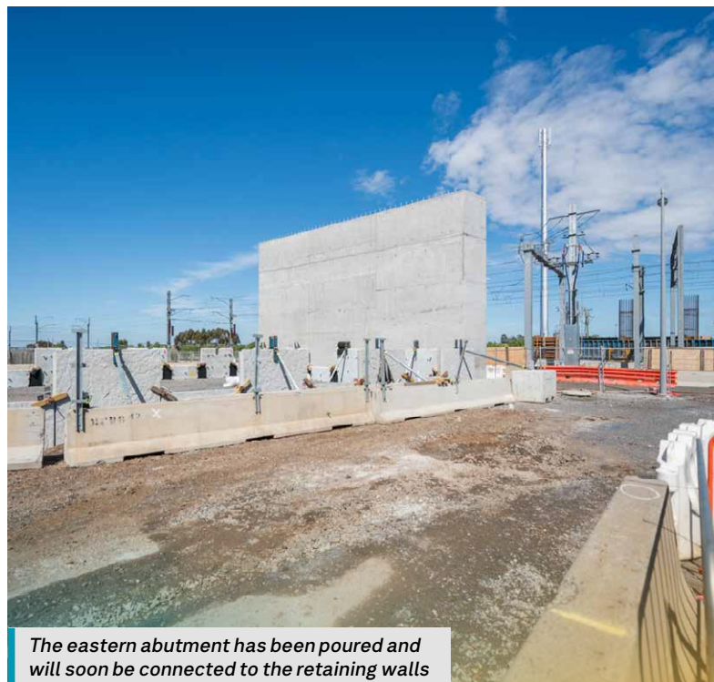
The eastern abutment has been poured and will soon be connected to the retaining walls