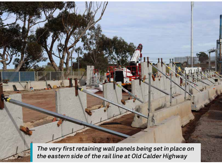
The very first retaining wall panels being set in place on the eastern side of the rail line at Old Calder Highway