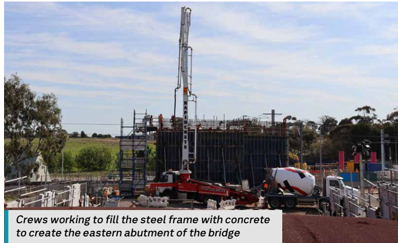
Crews working to fill the steel frame with concrete to create the eastern abutment of the bridge