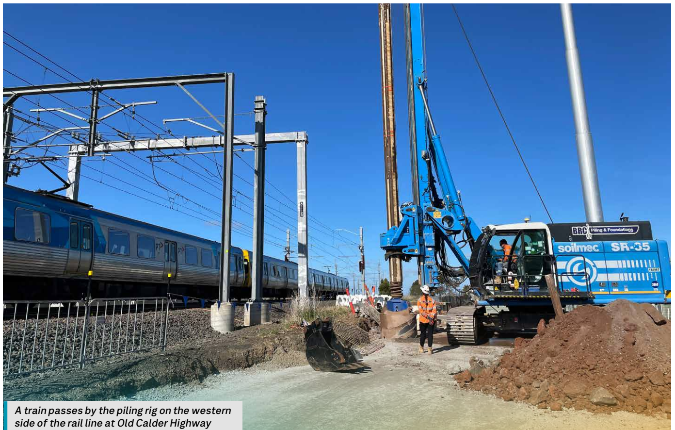
A train passes by the piling rig on the western side of the rail line at Old Calder Highway

More than 10,000 cubic metres of crushed rock and soil will fill the gaps between the retaining walls