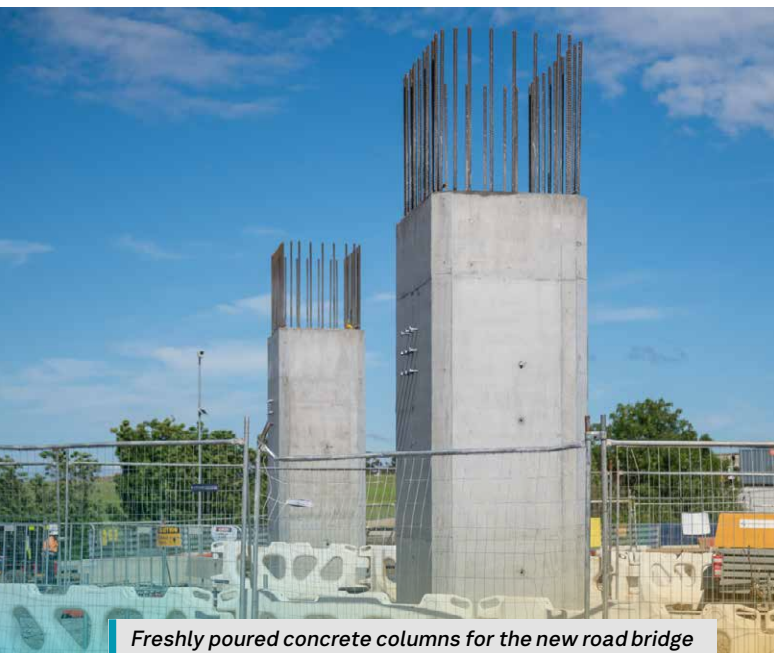
Freshly poured concrete columns for the new road bridge