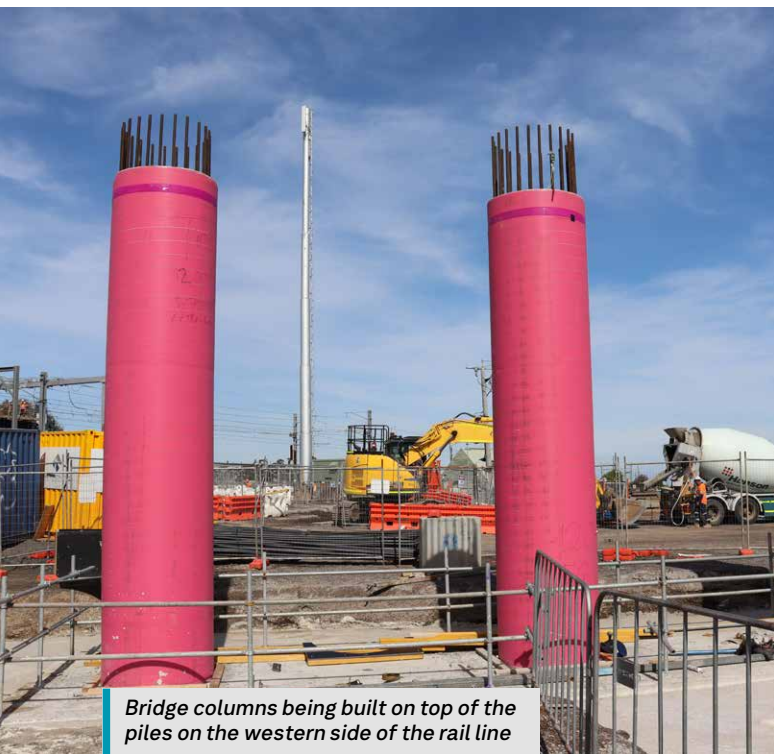
Bridge columns being built on top of the piles on the western side of the rail line