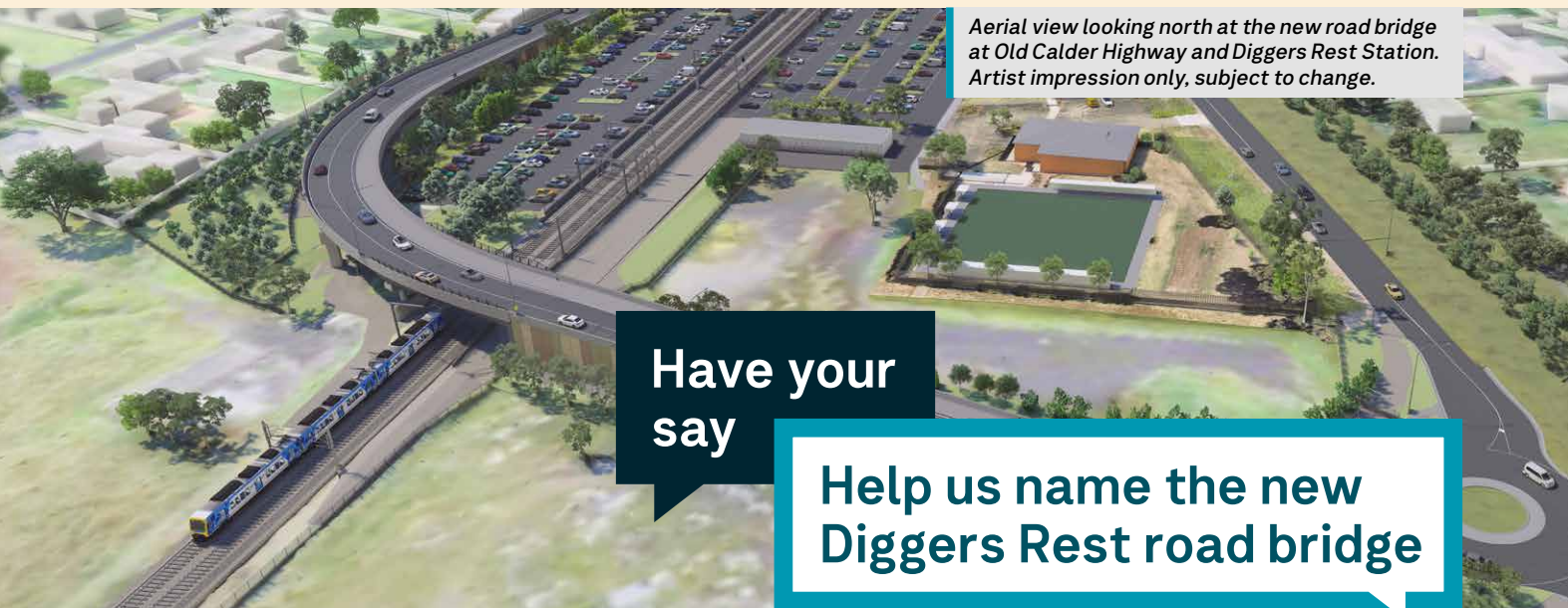
Aerial view looking north at the new road bridge at Old Calder Highway and Diggers Rest Station. Artist impression only, subject to change.

We are calling on the Diggers Rest community to help us choose a name for the new road bridge at Old Calder Highway in Diggers Rest.