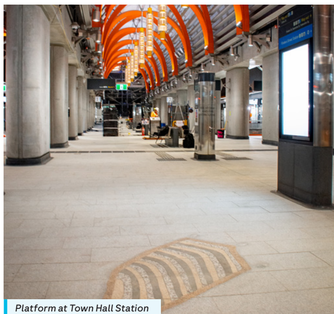
Platform at Town Hall Station

24 hour works are sometimes required during peak construction activities