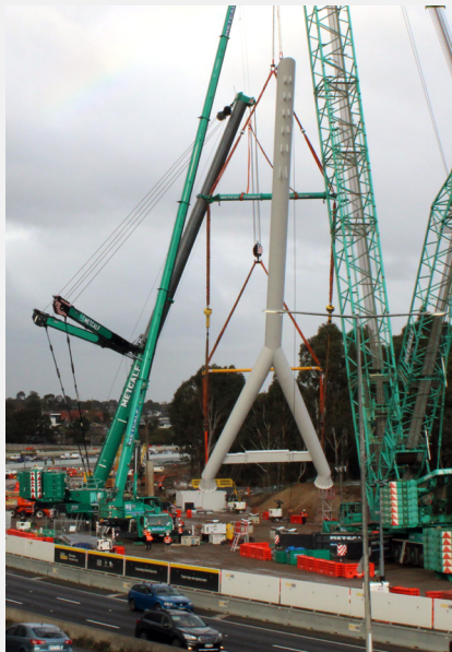
Installation of a 45m pylon to support the new Estelle Street bridge

See over the page for more details and upcoming disruptions.