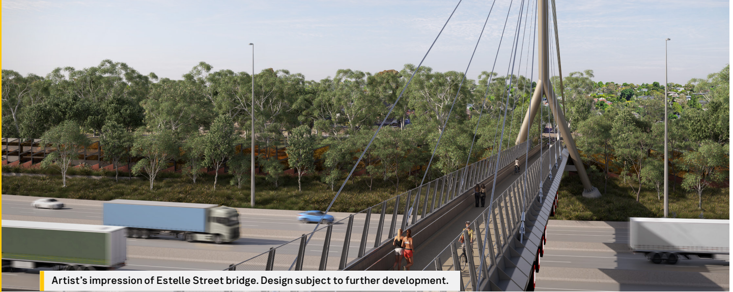
Artist's impression of Estelle Street bridge. Design subject to further development.