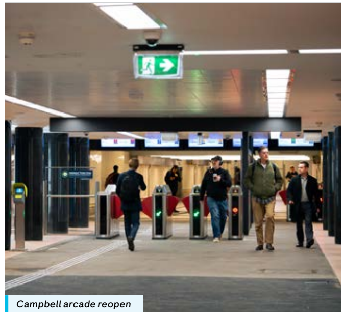
Campbell arcade reopen

24 hour works are sometimes required during peak construction activities