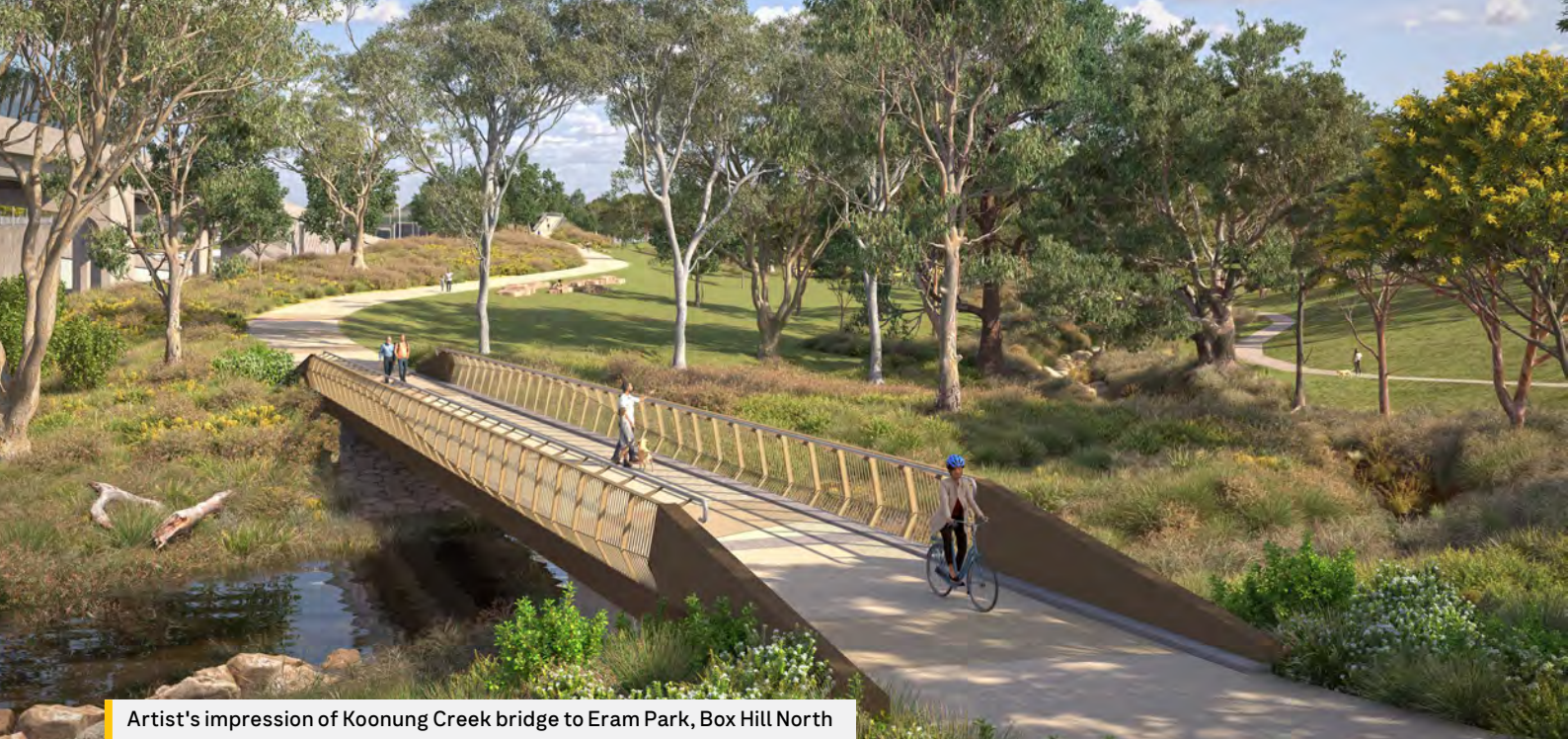
Artist's impression of Koonung Creek bridge to Eram Park, Box Hill North

In response to community feedback received through the Project's Environment Effects Statement (EES), the Urban Design and Landscape Plan includes design improvements to enhance walking and cycling connections, return improved open spaces and reduce construction disruption.