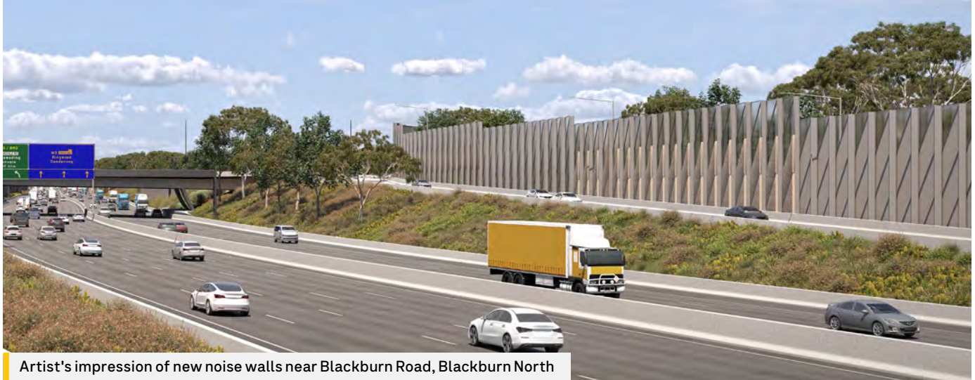
Artist's impression of new noise walls near Blackburn Road, Blackburn North