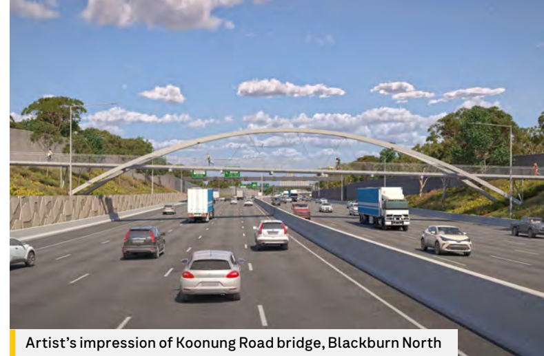
Artist's impression of Koonung Road bridge, Blackburn North

Junction Road Reserve will be needed to support construction and will be returned with new open grassed areas, more trees and plants, and a better connection to Koonung Creek Trail at Springvale Road.