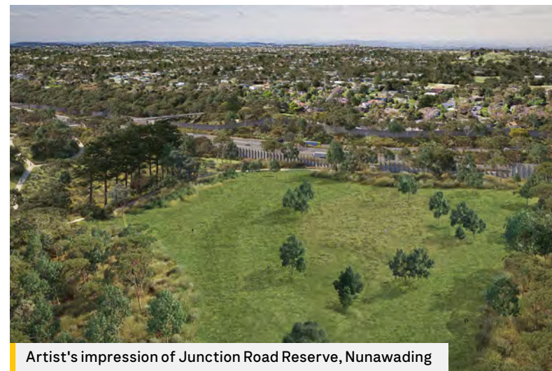
Artist's impression of Junction Road Reserve, Nunawading