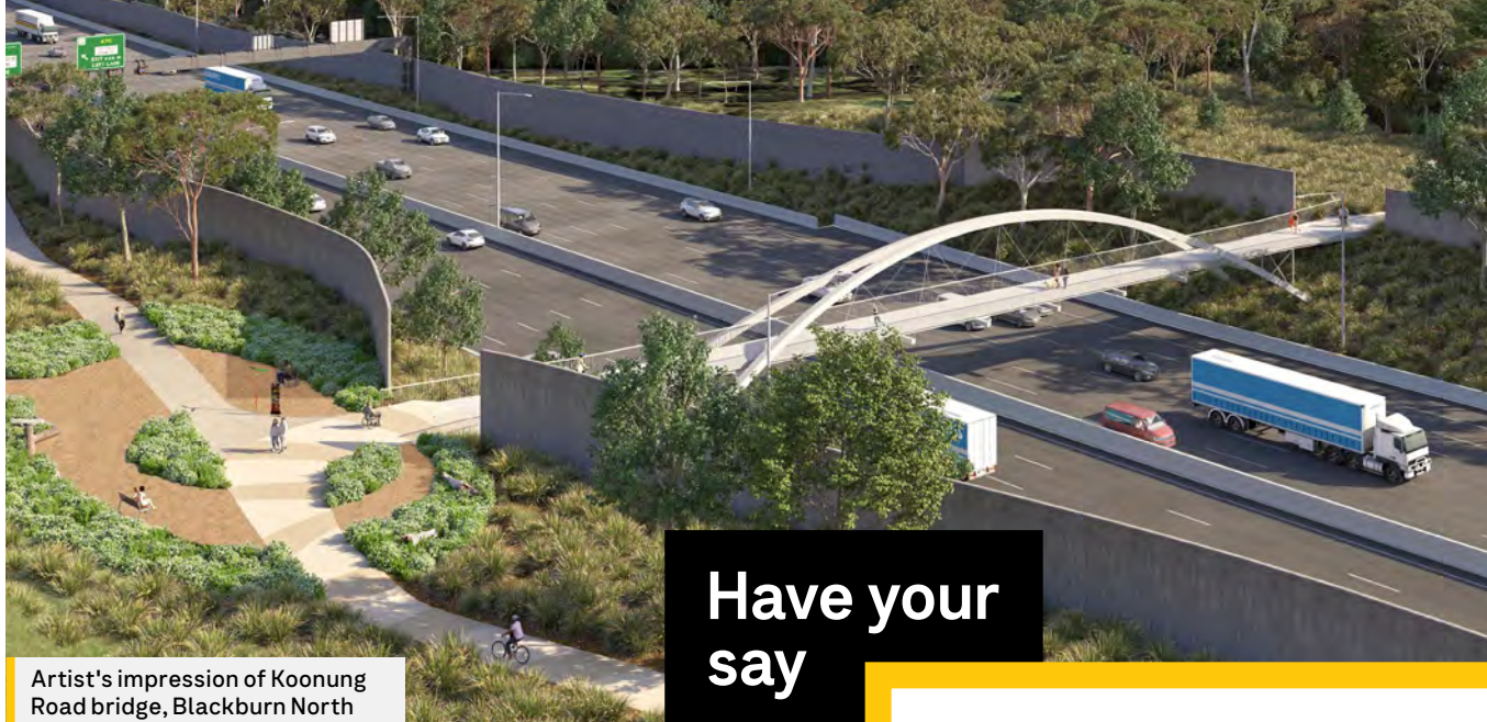
Artist's impression of Koonung Road bridge, Blackburn North