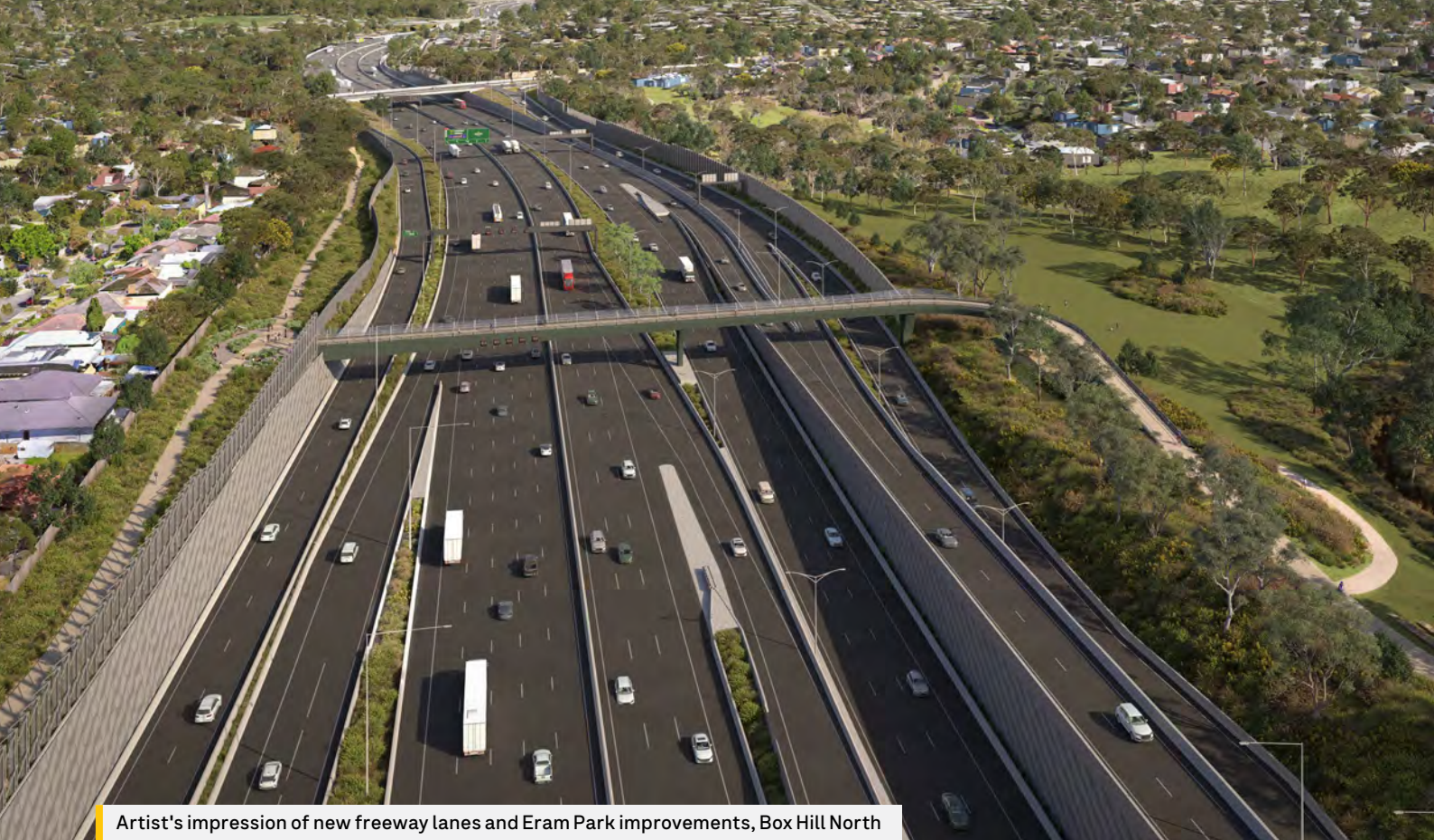
Artist's impression of new freeway lanes and Eram Park improvements, Box Hill North