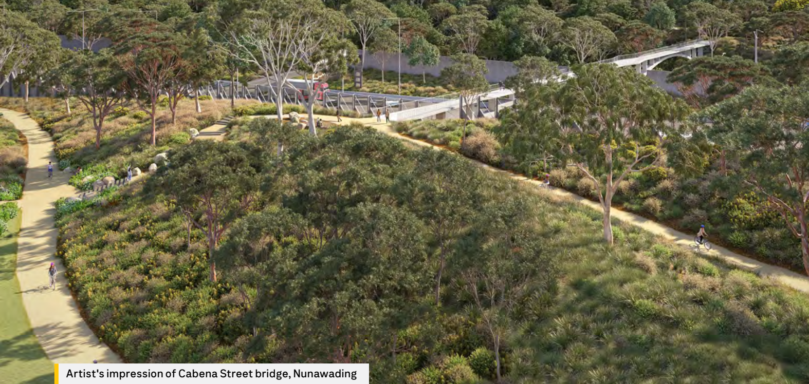
Artist's impression of Cabena Street bridge, Nunawading