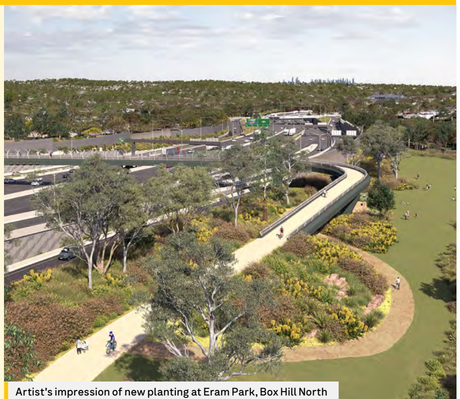
Artist's impression of new planting at Eram Park, Box Hill North

We've also started planting trees early in local places nearby including parks, reserves and schools.