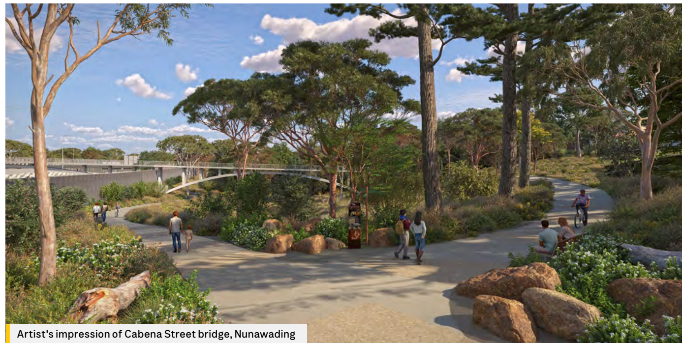
Artist's impression of Cabena Street bridge, Nunawading

In response to community feedback, the existing bridge at Eram Road will remain open for people to use while we build the new bridge.