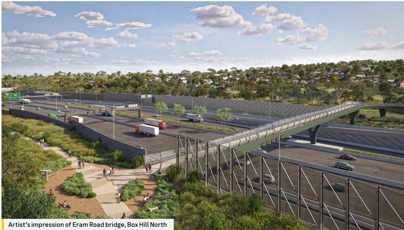
Artist's impression of Eram Road bridge, Box Hill North

More than 1.6 kilometres of Koonung Creek Trail will also be upgraded with improved surfaces and new trees and plants.