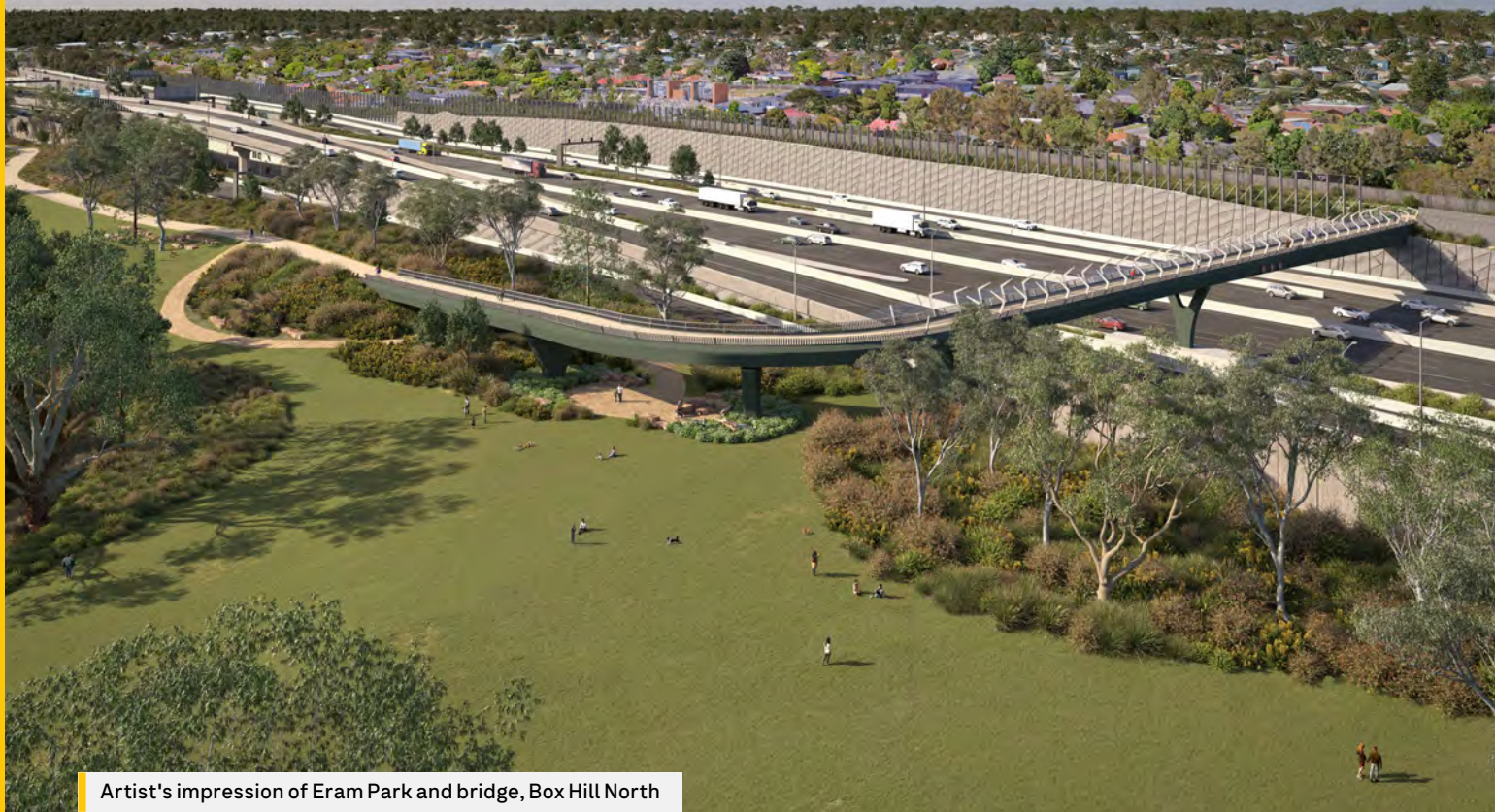
Artist's impression of Eram Park and bridge, Box Hill North