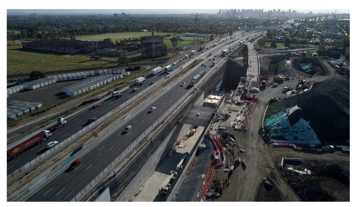
Figure 1 Aerial view of Southern outbound portal.

For the latest updates visit westgatetunnelproject.vic.gov.au/disruptions.