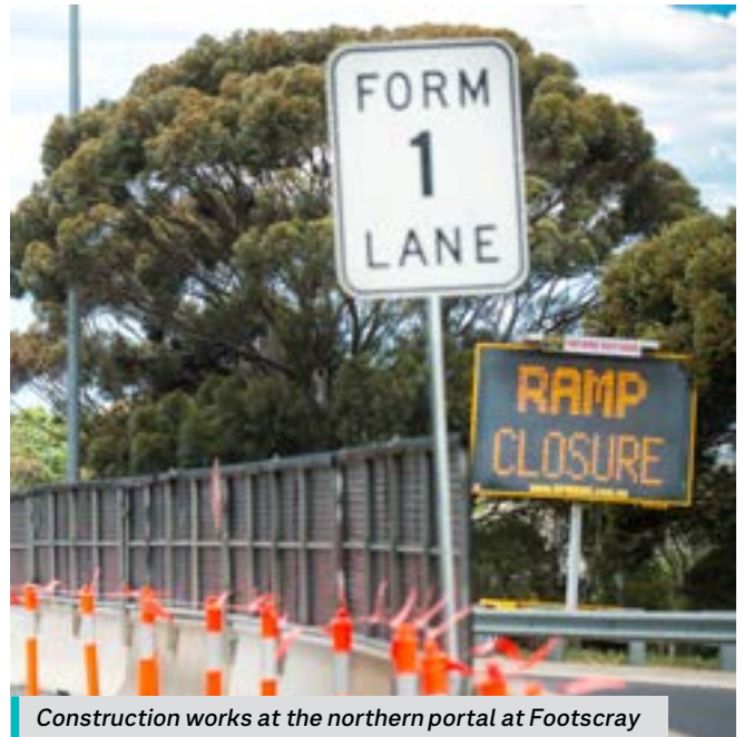
Construction works at the northern portal at Footscray