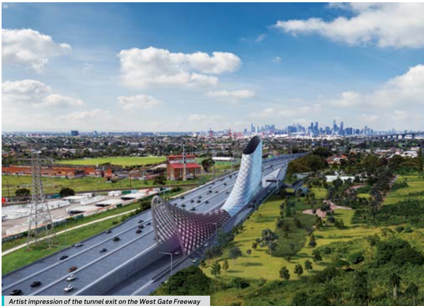
Artist impression of the tunnel exit on the West Gate Freeway