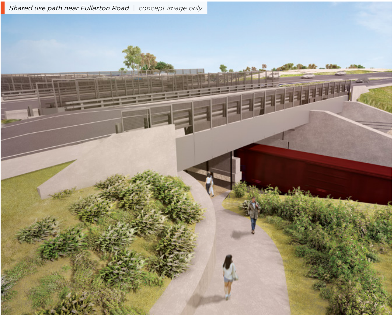
Shared use path near Fullarton Road | concept image only

The project will also upgrade other local paths and connections to make walking and cycling safer and easier.