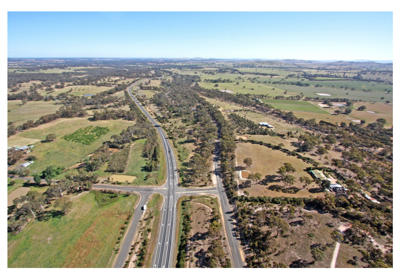
Military Bypass Road and Western Highway Intersection looking north

Completing the duplication of the highway between Ballarat and Stawell would improve freight efficiency, enhance safety and amenity, and deliver major benefits to industries that depend upon the highway for access to resources, and domestic and export markets.