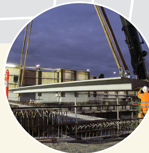
The concrete beams will form the foundations of the new station

A new Glenroy Station will provide modern and safe facilities for the 3,500 people who use the station each day.