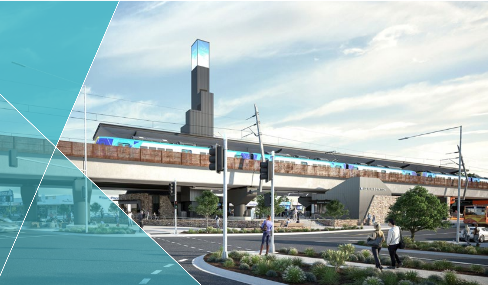
Artists impression only, subject to change.

Major works to remove the dangerous and congested level crossing at Maroondah Highway, Lilydale and build a new station are well underway.