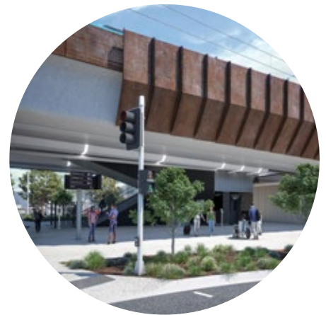
Artists impression only, subject to change.

We took that on board, worked with Yarra Ranges Council and their own landscaping strategies for the area and have included flowering shrubs for colour, as well as native plantings to reflect the rural history of the area.