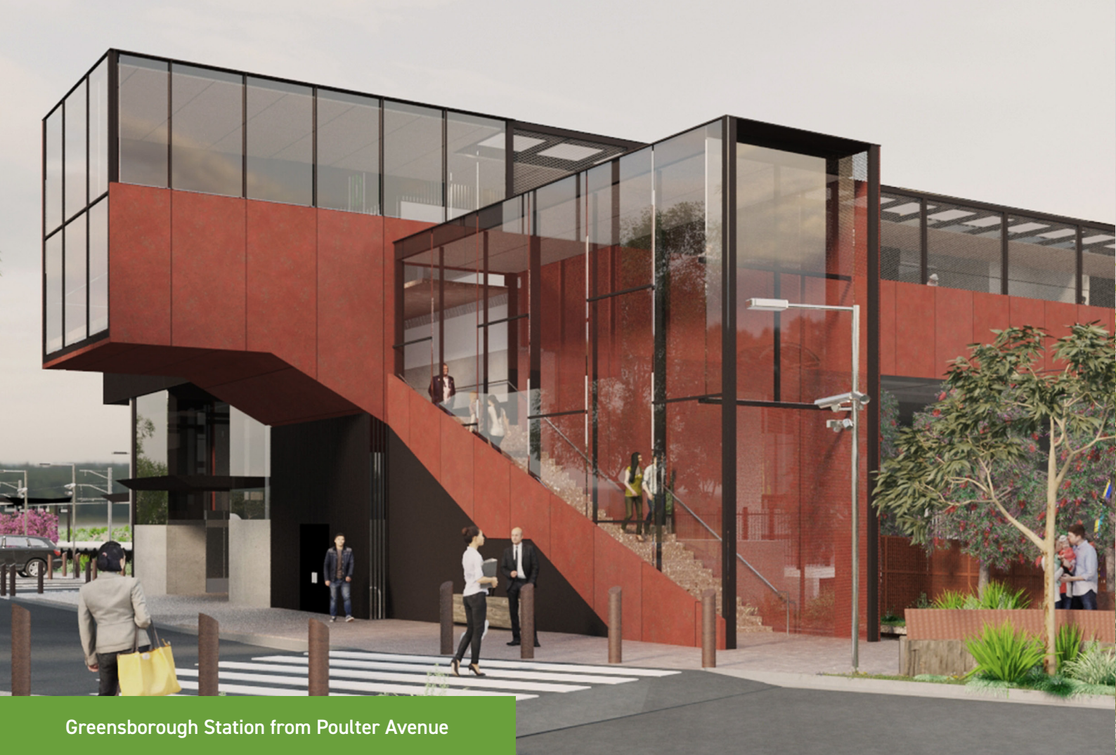
Greensborough Station from Poulter Avenue