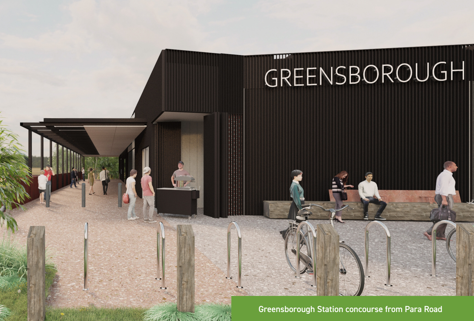
Greensborough Station concourse from Para Road