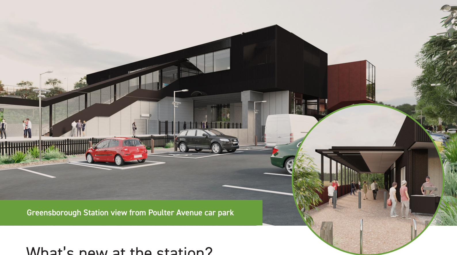
Greensborough Station view from Poulter Avenue car park