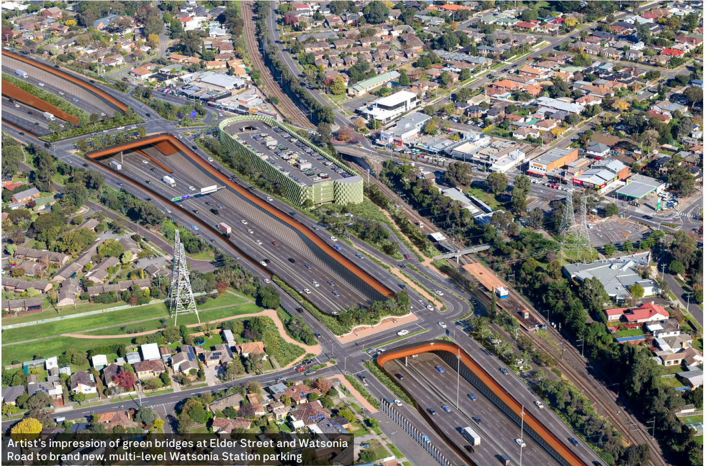
Artist's impression of green bridges at Elder Street and Watsonia Road to brand new, multi-level Watsonia Station parking