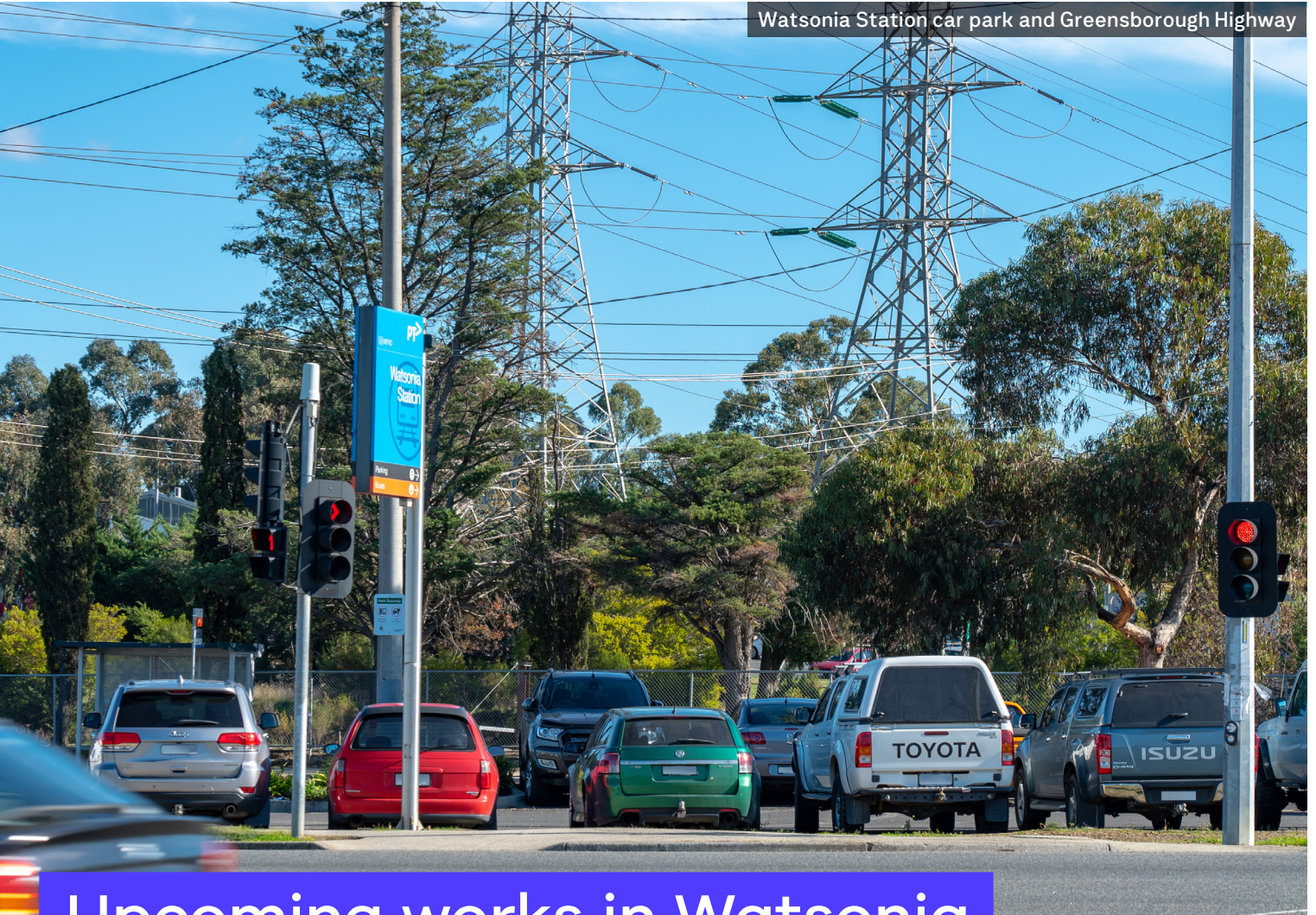
Watsonia Station car park and Greensborough Highway