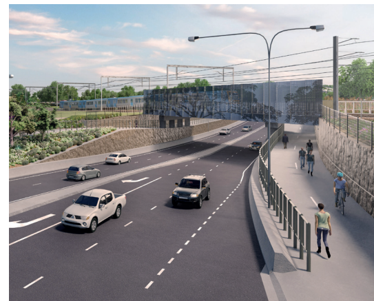
New road underpass and shared use path. Artist impression only. Subject to change.