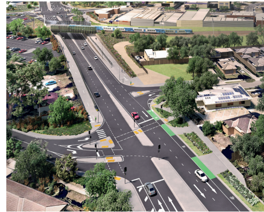
Clyde Road looking south. Artist impression only. Subject to change.

New bike storage facilities for 90 bikes will provide more ways to access public transport.