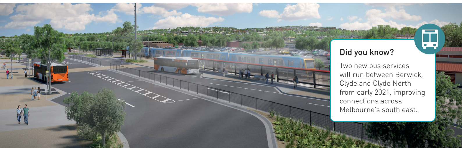
New Berwick Station bus interchange. Artist impression only. Subject to change.