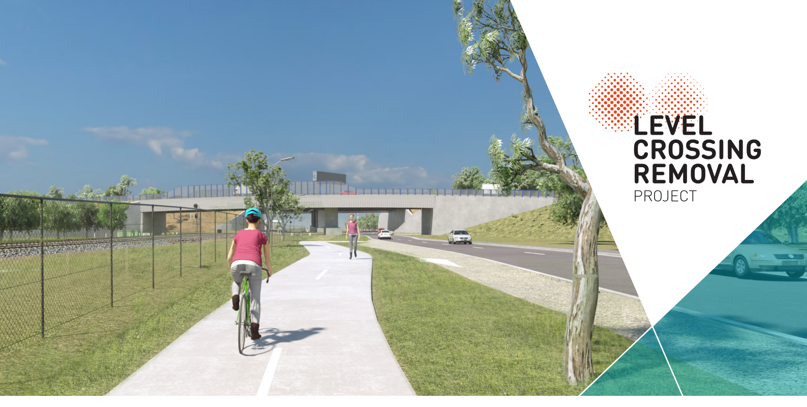
Artist's impression – subject to change