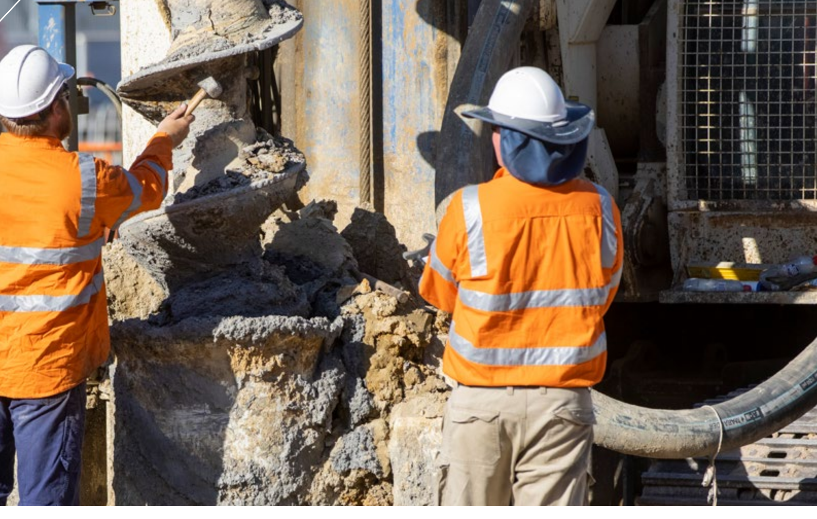
Piling rig used to dig foundations at Manchester Road, Mooroolbark.