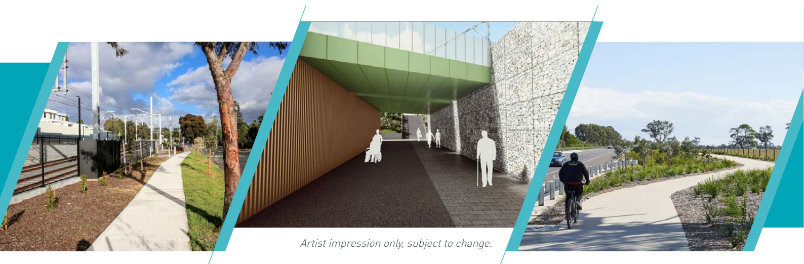
Artist impression only, subject to change.

You told us you would like landscaping that visually enhanced the local area, making the community feel safer and more secure. You asked for native plants, landscaping that enhanced local flora and fauna, and plantings that require low maintenance.