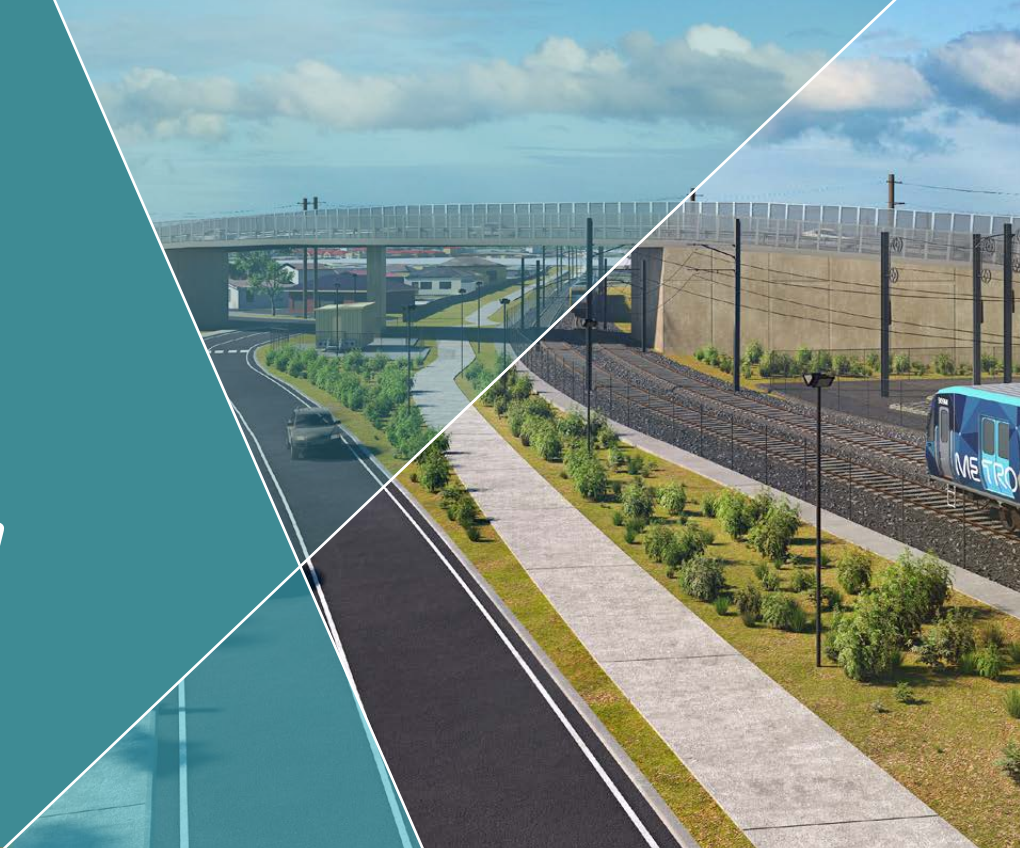
The new Camms Road bridge spanning over Fairfield Street and the Cranbourne line. Artist impression only, subject to change.

The Victorian Government is investing more than $1 billion to duplicate the Cranbourne line, remove four level crossings including Camms Road and build a new Merinda Park Station – improving safety, reducing congestion and allowing for more trains, more often.