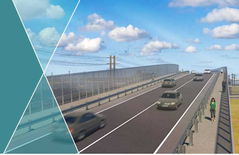
Cars travelling over the Camms Road bridge, over the Cranbourne line. Artist impression only, subject to change.

We sought feedback on what you value about the local area, how you move around and your design preferences.