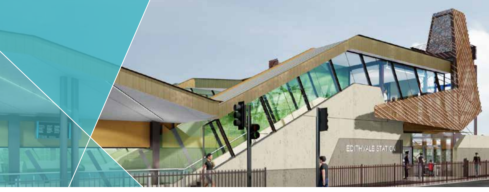
New Edithvale Station entrance - artist's impression

The Level Crossing Removal Project is removing 18 level crossings and building 12 new stations as part of a $3 billion upgrade along the Frankston line that will improve safety, reduce congestion and allow more trains to run more often.