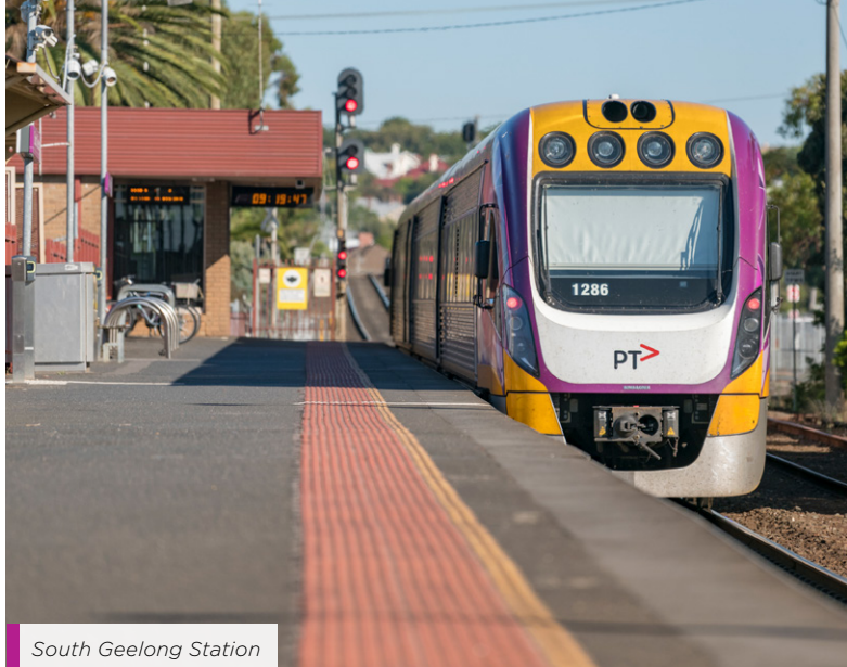
South Geelong Station