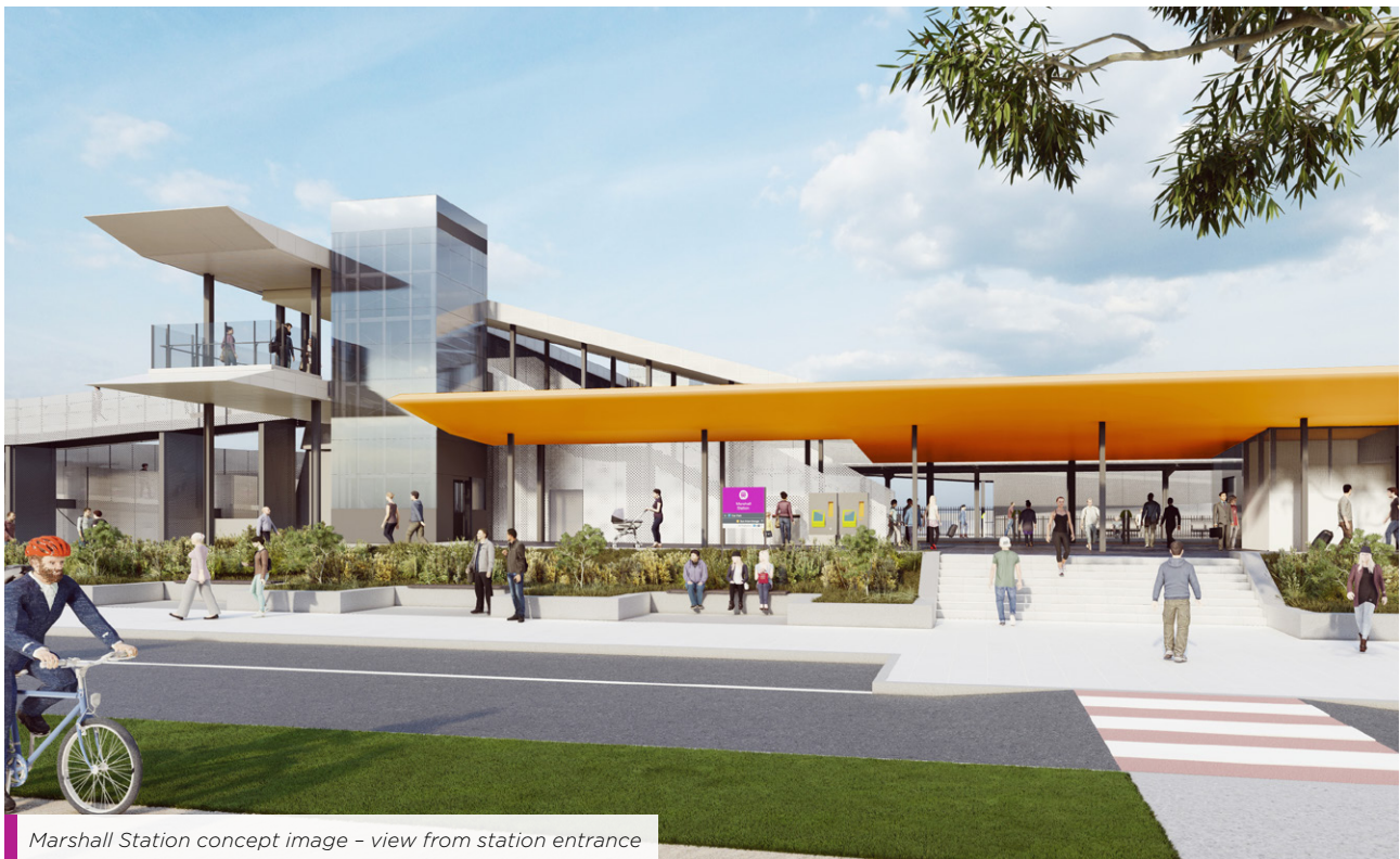
Marshall Station concept image - view from station entrance

We will undertake a staged approach to upgrading Marshall Station so we can carry out works safely, while keeping the station open and minimising disruption as much as possible.