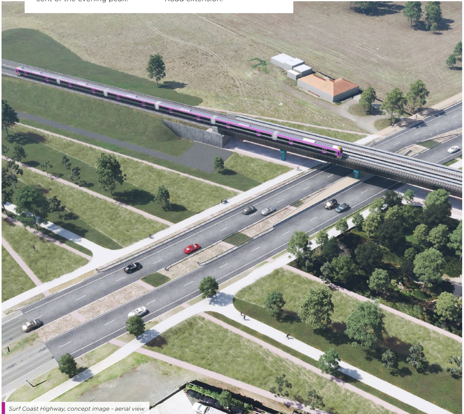
Surf Coast Highway, concept image - aerial view

Once completed, passengers will benefit from five train services per hour during the peaks and three per hour between the peaks for Marshall and Waurn Ponds stations, new public open space and a continuous walking and cycling path between South Geelong and Waurn Ponds stations with over 5km of new connections.