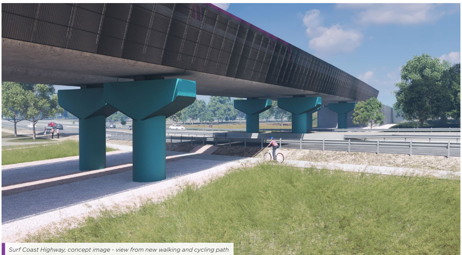
Surf Coast Highway, concept image - view from new walking and cycling path

The walking and cycling path will travel underneath the new rail bridge at the Surf Coast Highway and safely connect cyclists and pedestrians to the west of Baanip Boulevard, where traffic lights will provide safe passage across the road.