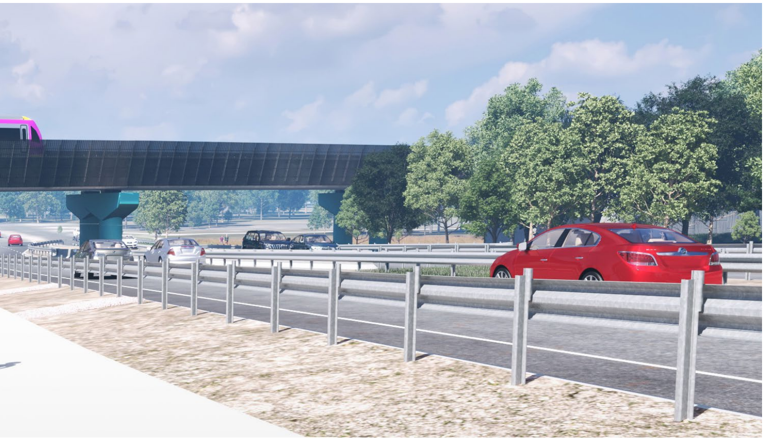
Surf Coast Highway, concept image - view toward Torquay