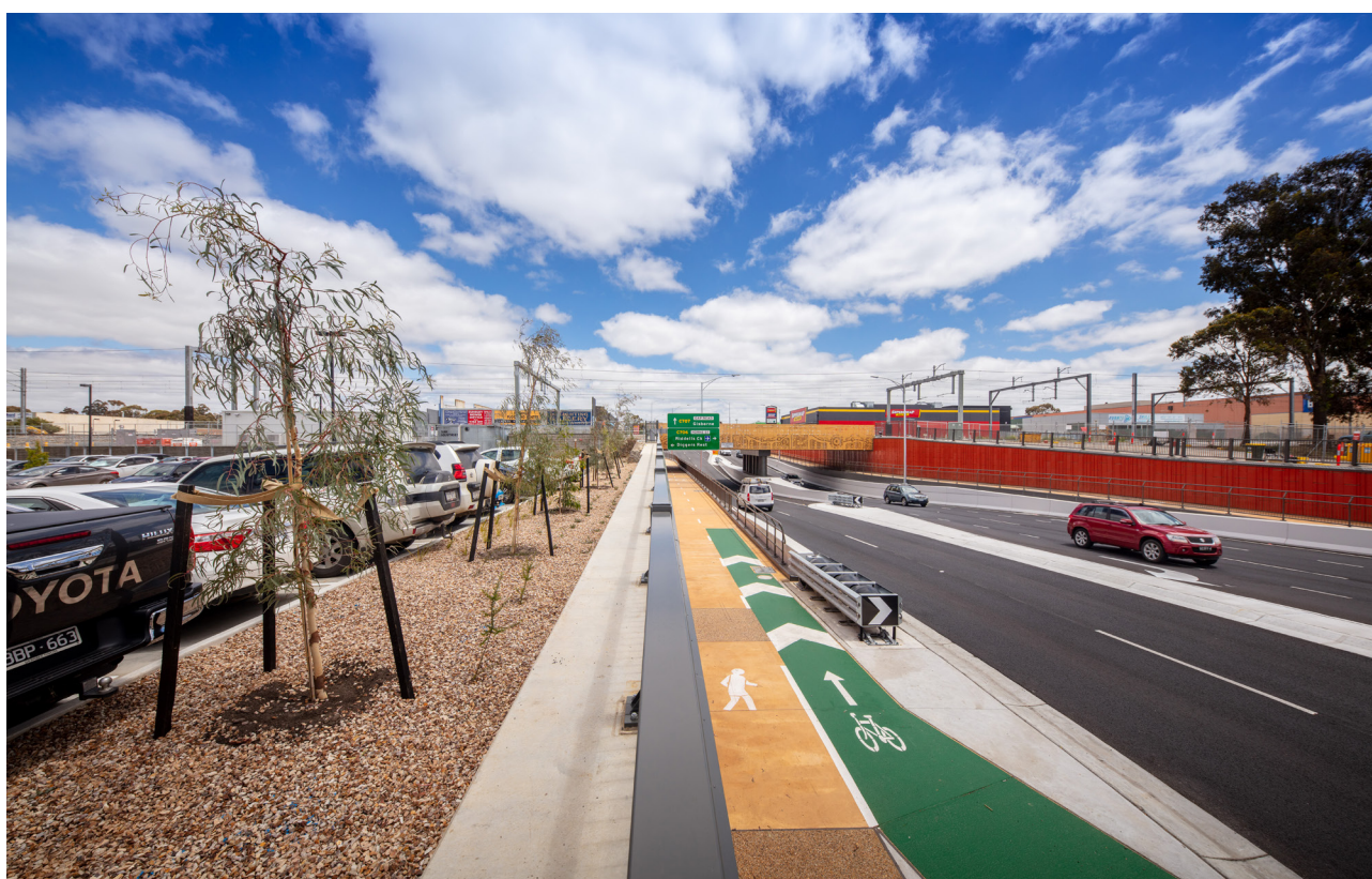
Gap Road underpass