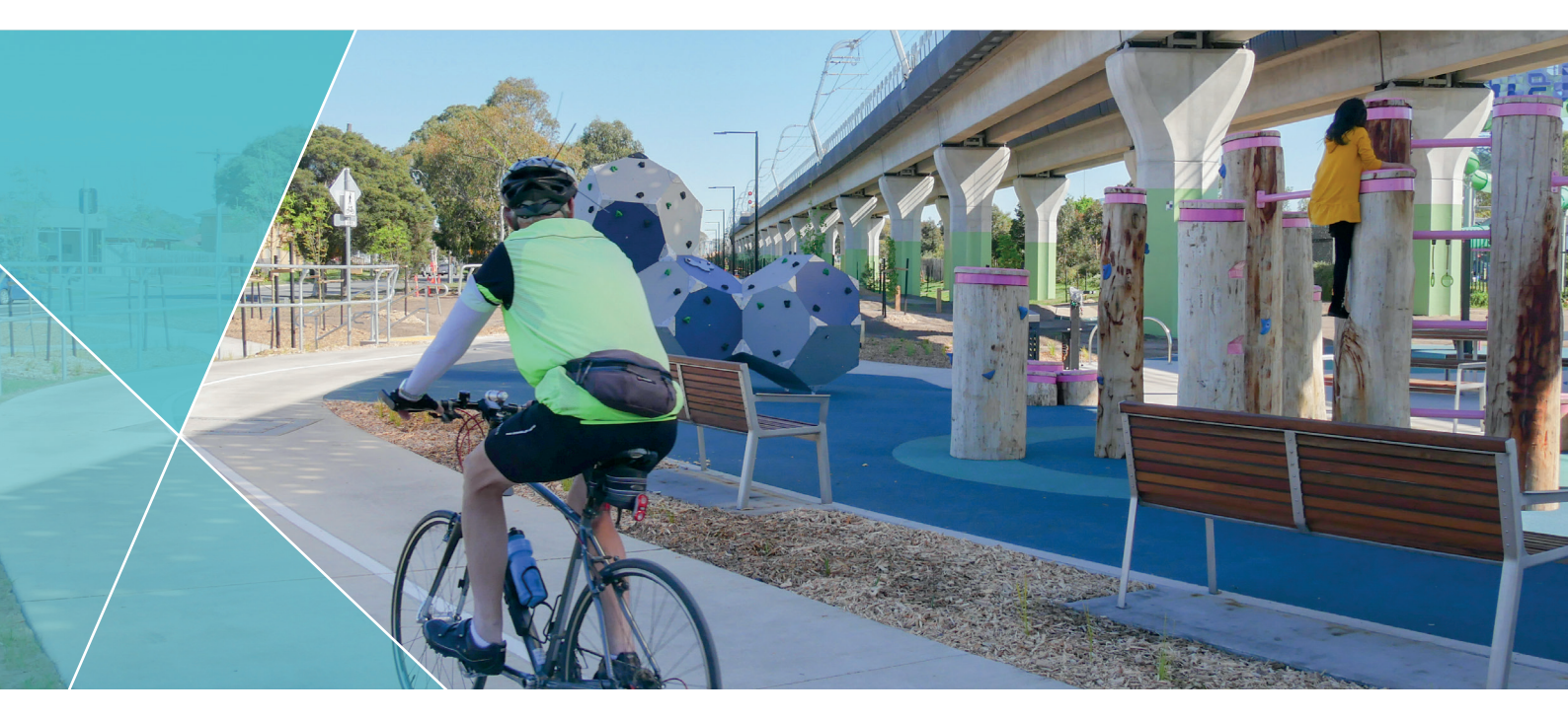
A cyclist using the shared path built as part of the Caulfield to Dandenong project.