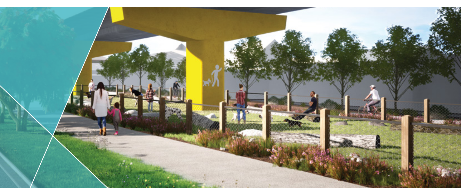
Dog park near Audley Street | artist impressions only