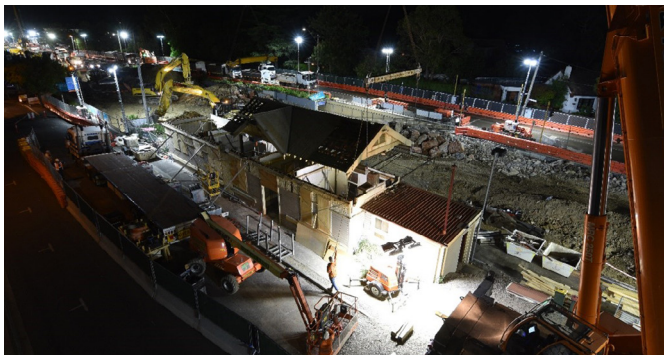
The boom gates and old rail infrastructure were removed and the Mont Albert Station building was carefully dismantled.