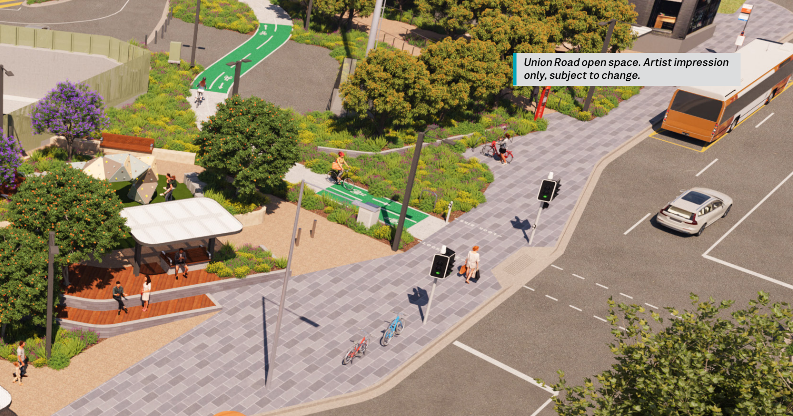
Union Road open space. Artist impression only, subject to change.