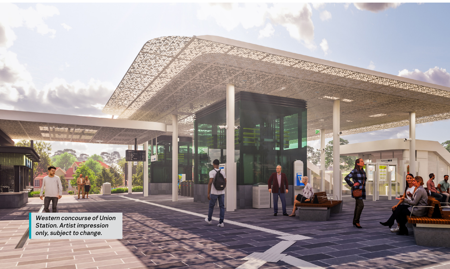
Western concourse of Union Station. Artist impression only, subject to change.