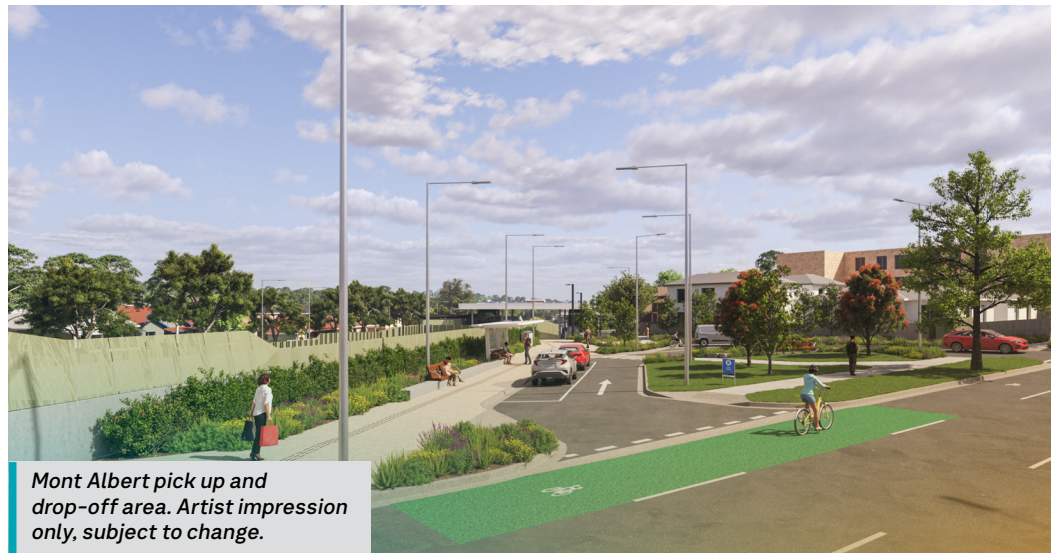
Mont Albert pick up and drop-off area. Artist impression only, subject to change.