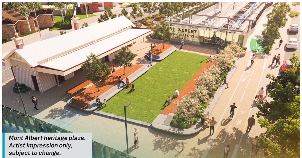
Mont Albert heritage plaza. Artist impression only, subject to change.