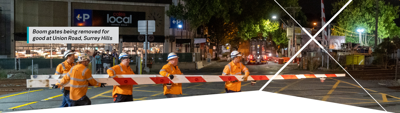
Boom gates being removed for good at Union Road, Surrey Hills