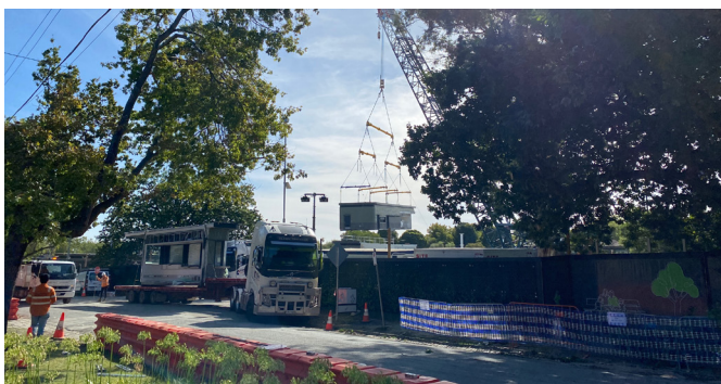
Union Station buildings, which were built off-site, were delivered and craned into position.