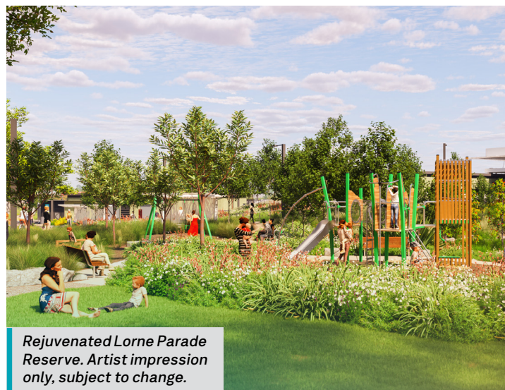
Rejuvenated Lorne Parade Reserve. Artist impression only, subject to change.

All images show trees and plants 3-5 years post-planting.