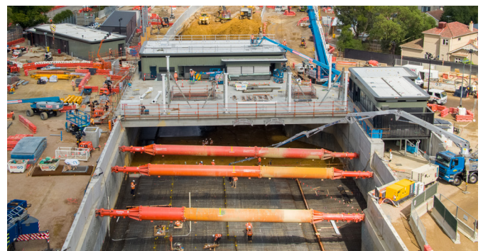
The Union Station buildings were craned onto the western and eastern concourses.