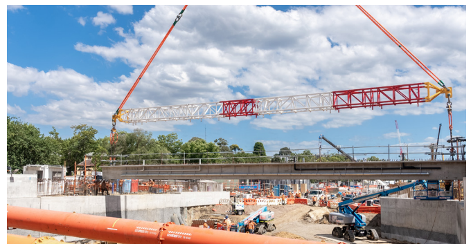
Huge, concrete beams were laid across the rail trench to help form the foundation of the new Union Station concourses.