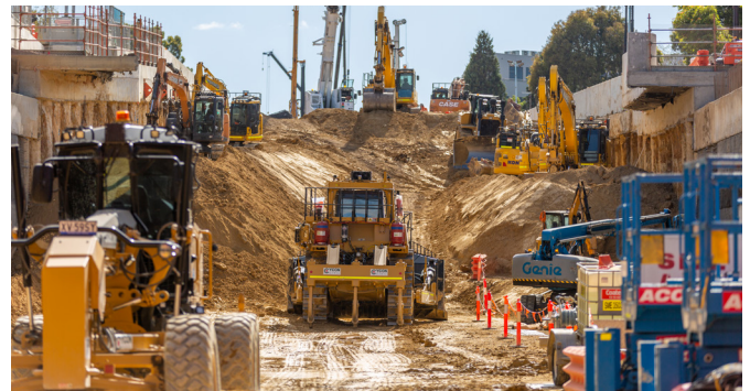
Over 80 Olympic swimming pools worth of soil was excavated to dig the 1.3km rail trench.