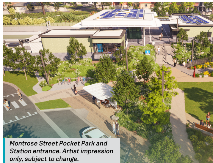
Montrose Street Pocket Park and Station entrance. Artist impression only, subject to change.