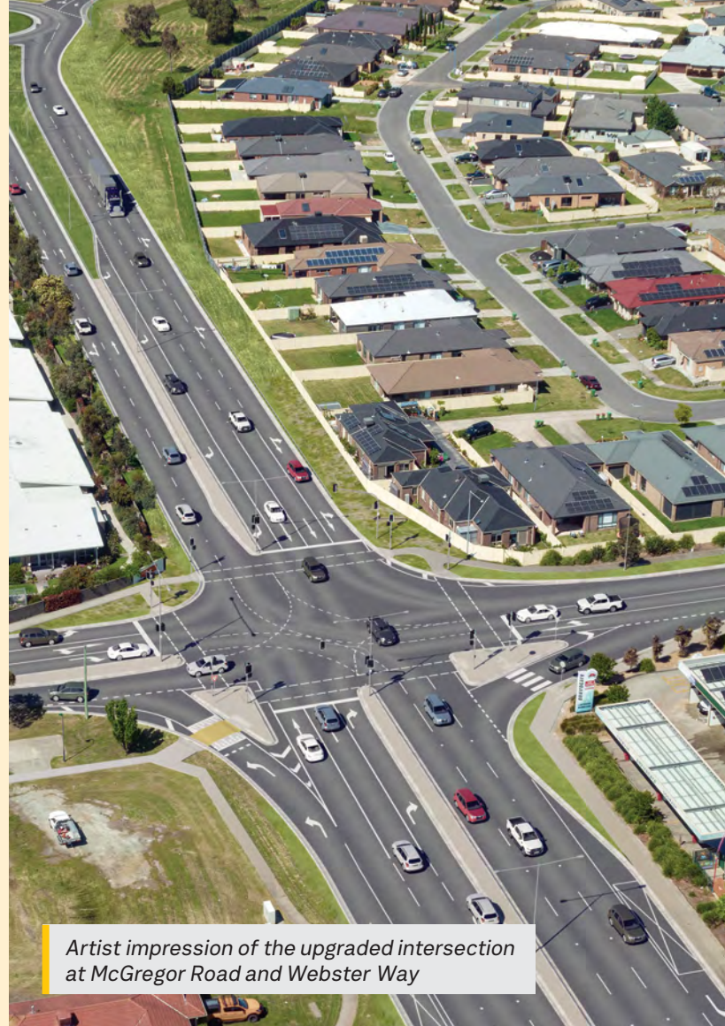
Artist impression of the upgraded intersection at McGregor Road and Webster Way