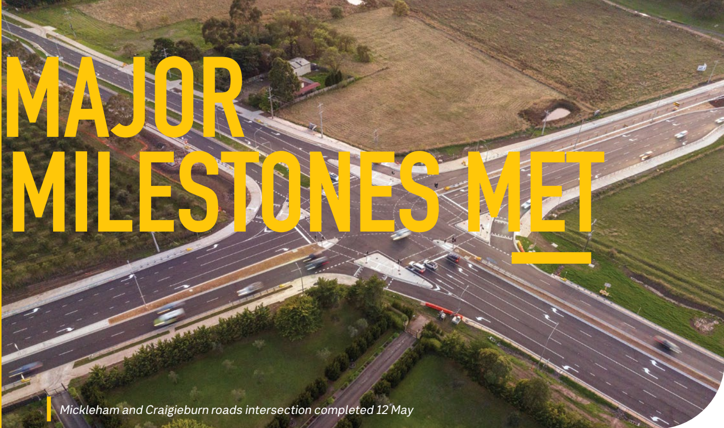
Mickleham and Craigieburn roads intersection completed 12 May