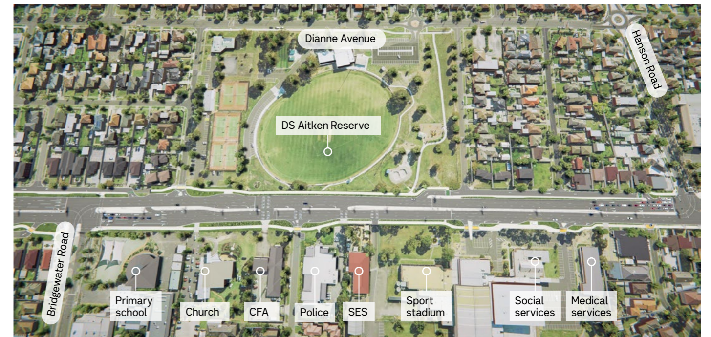
Artist impression of upgraded Craigieburn Road between Hanson Road and Bridgewater Road (subject to change)

From 23 June until 19 August, Craigieburn Road will be closed between Hanson and Bridgewater roads so we can fast track building new lanes.