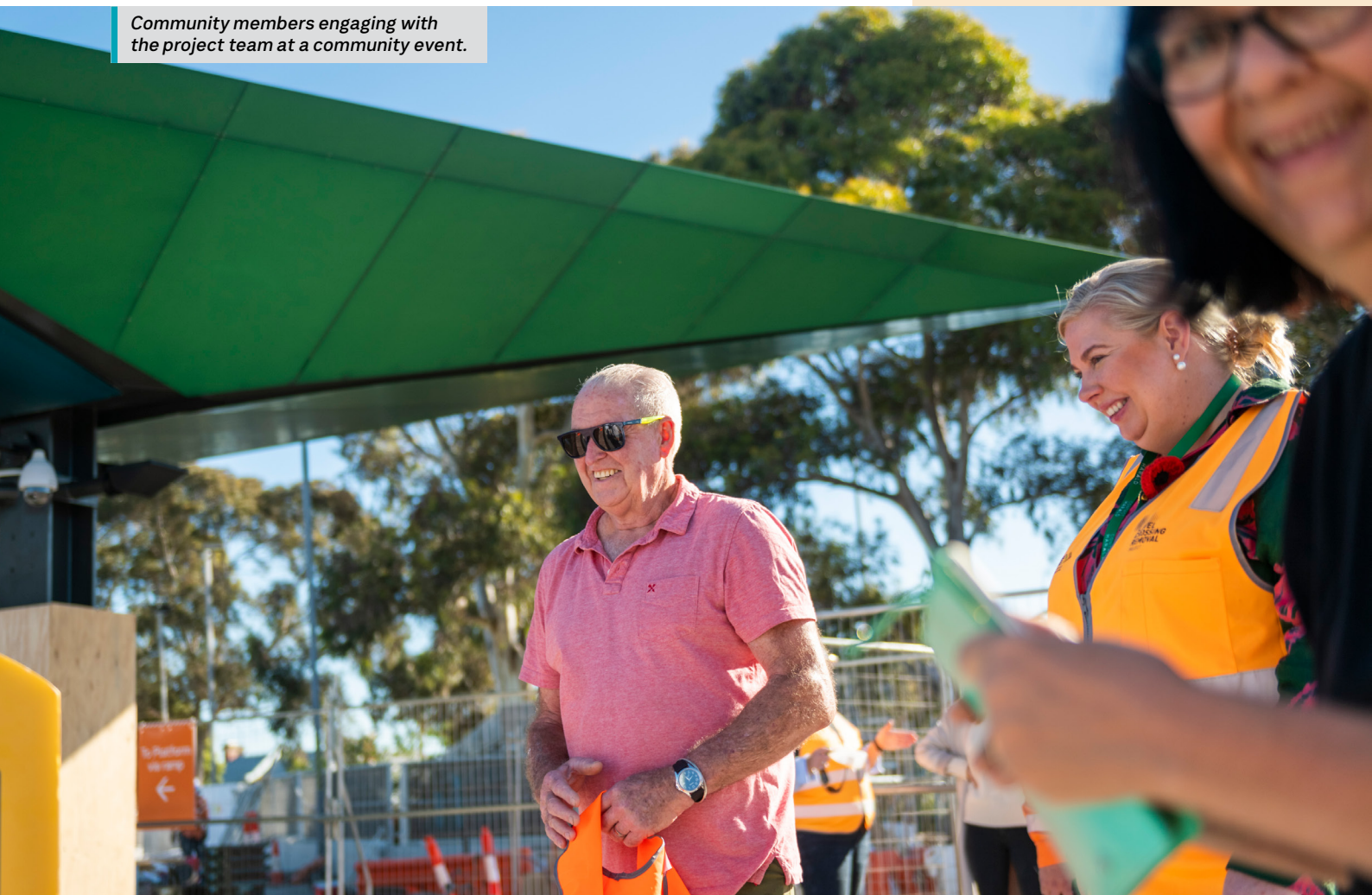
Community members engaging with the project team at a community event.

Registration is required. Please visit our online engagement hub for more information, and to register your attendance.