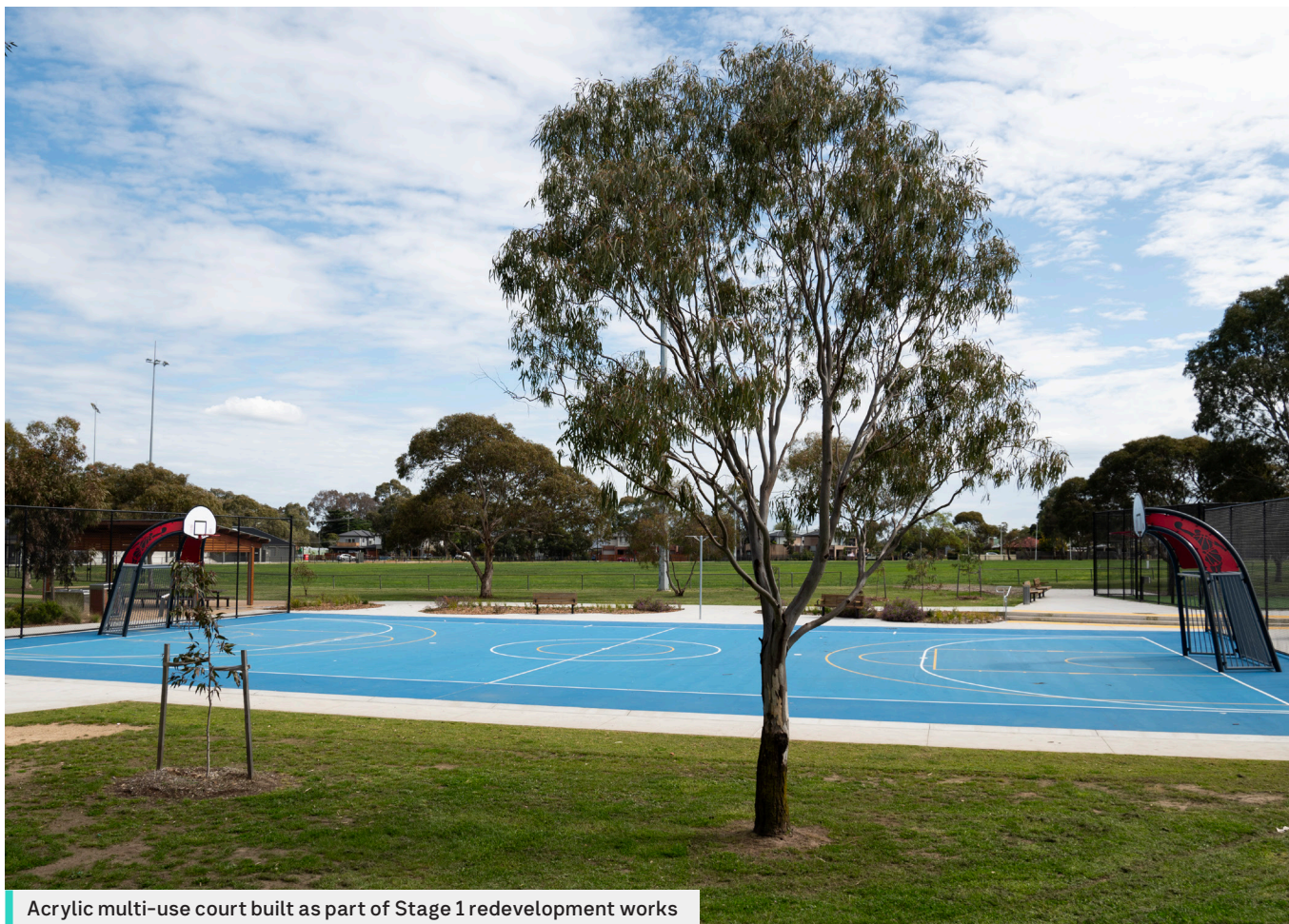
Acrylic multi-use court built as part of Stage 1 redevelopment works