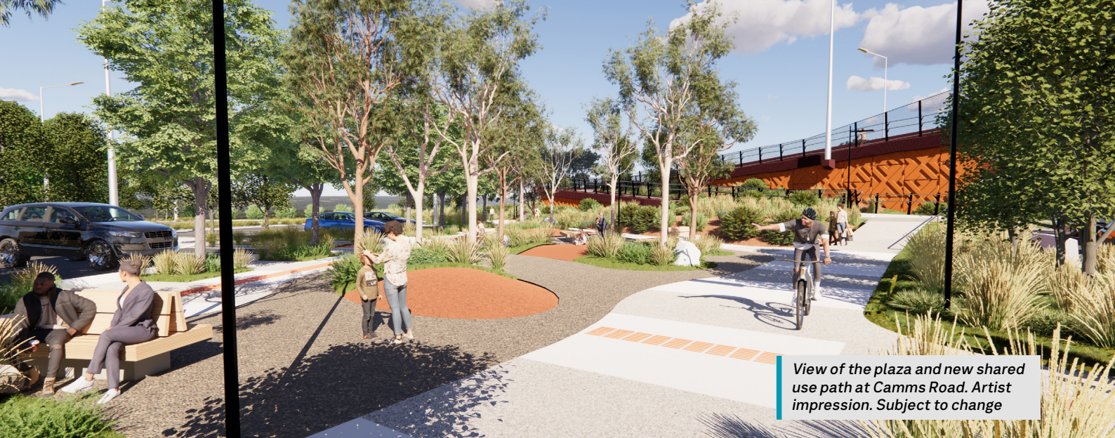
View of the plaza and new shared use path at Camms Road. Artist impression. Subject to change