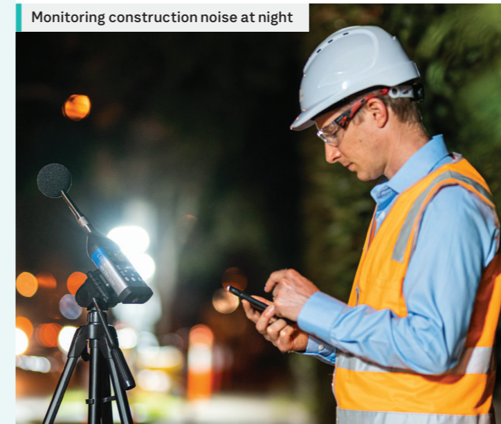
Monitoring construction noise at night