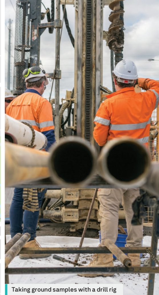
Taking ground samples with a drill rig