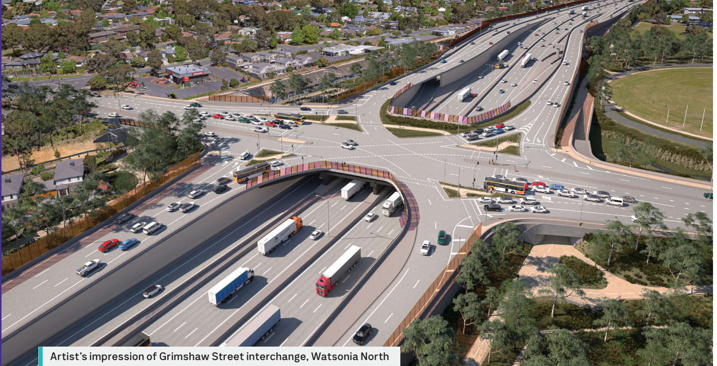
Artist's impression of Grimshaw Street interchange, Watsonia North