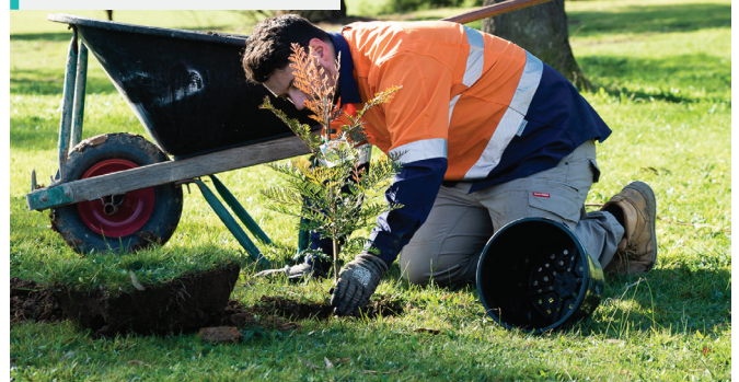
Tree planting is underway

For every tree removed to build North East Link at least two will be planted, helping to grow a greener north and east.