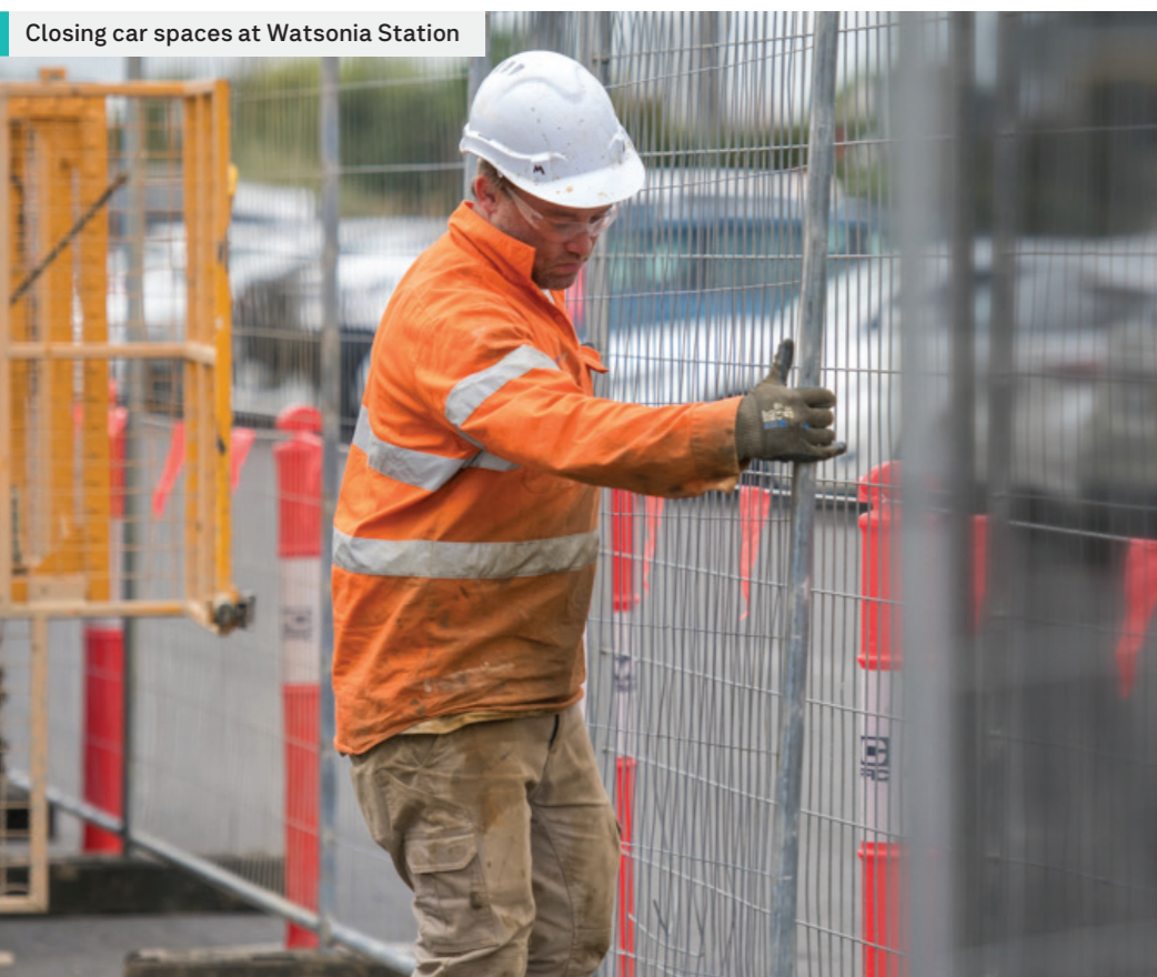
Closing car spaces at Watsonia Station