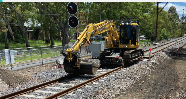
Upgrading tracks and equipment on the Hurstbridge train line

For further details and to plan your journey please visit ptv.vic.gov.au or call 1800 800 007.