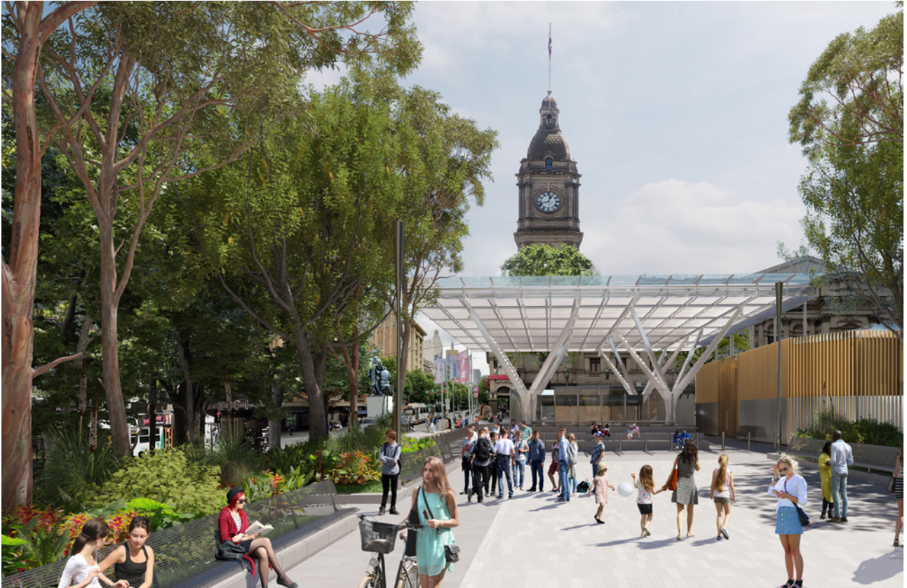
Concept image of Town Station's City Square entrance on the corner of Swanston and Collins streets.

We thank everyone for their patience while we progress closer to completing Town Hall Station.