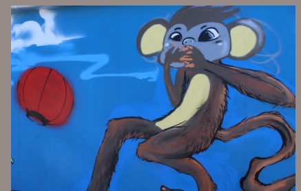
The "year of the monkey" mural coming to life last month in St Albans