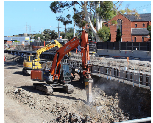
Excavation works and rock breaking at Main Road

temporary car park on St Albans Road (refer to car park map in this update). This closure has enabled the team to continue the excavation north along the rail alignment.