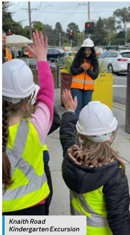
Knaith Road Kindergarten Excursion