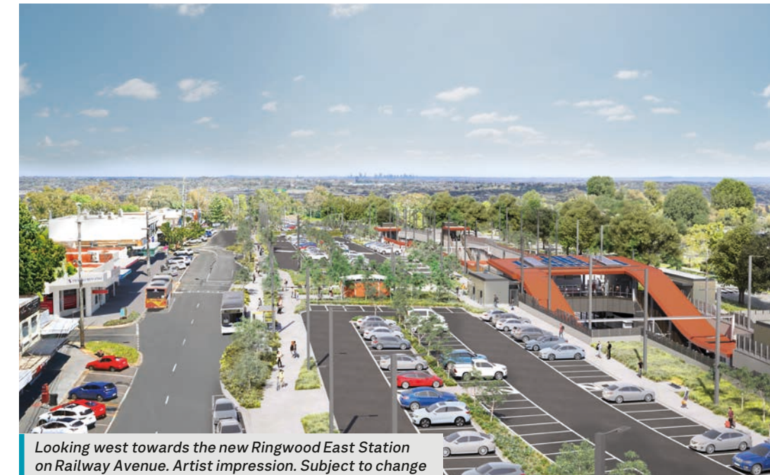
Looking west towards the new Ringwood East Station on Railway Avenue. Artist impression. Subject to change