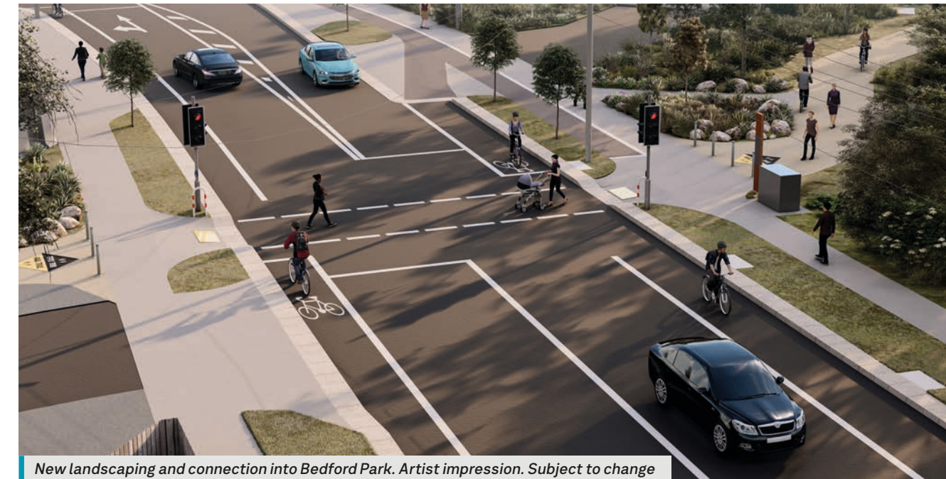
New landscaping and connection into Bedford Park. Artist impression. Subject to change