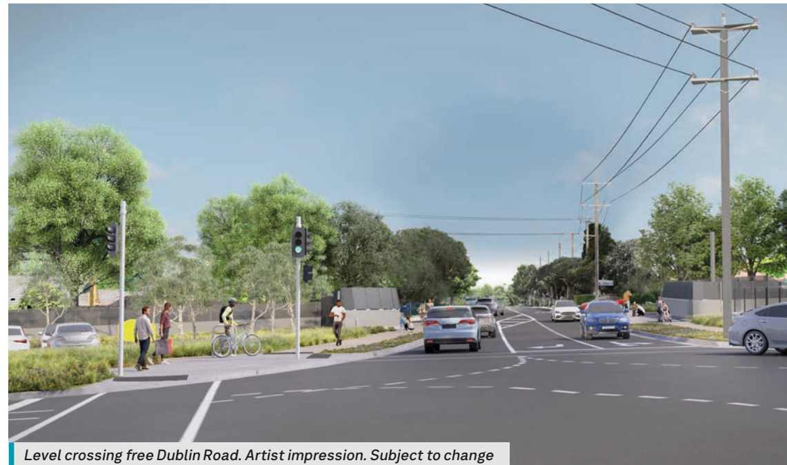
Level crossing free Dublin Road. Artist impression. Subject to change

Looking west towards the new Ringwood East Station on Railway Avenue A wide-angle view of the new station building and surrounding landscaped area, including parking lots and green spaces.