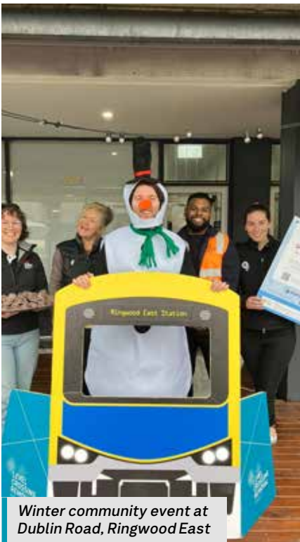
Winter community event at Dublin Road, Ringwood East

We're grateful to the community for its support and look forward to continuing to work with you to make Ringwood safer and more connected.