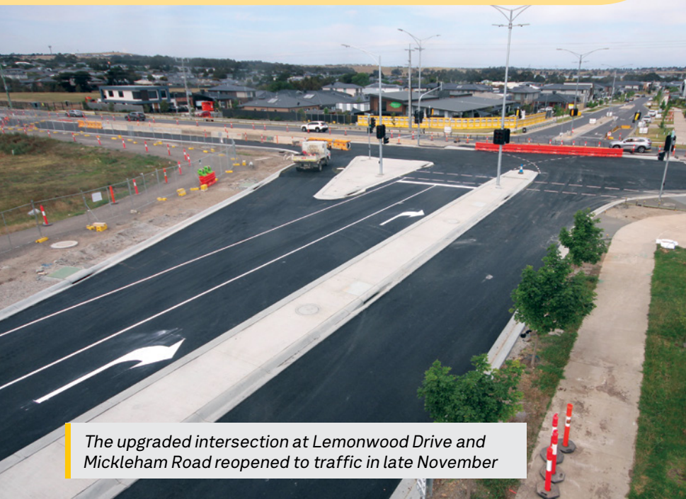
The upgraded intersection at Lemonwood Drive and Mickleham Road reopened to traffic in late November

We'll start upgrading the Hillview Road side of the intersection in early 2024.