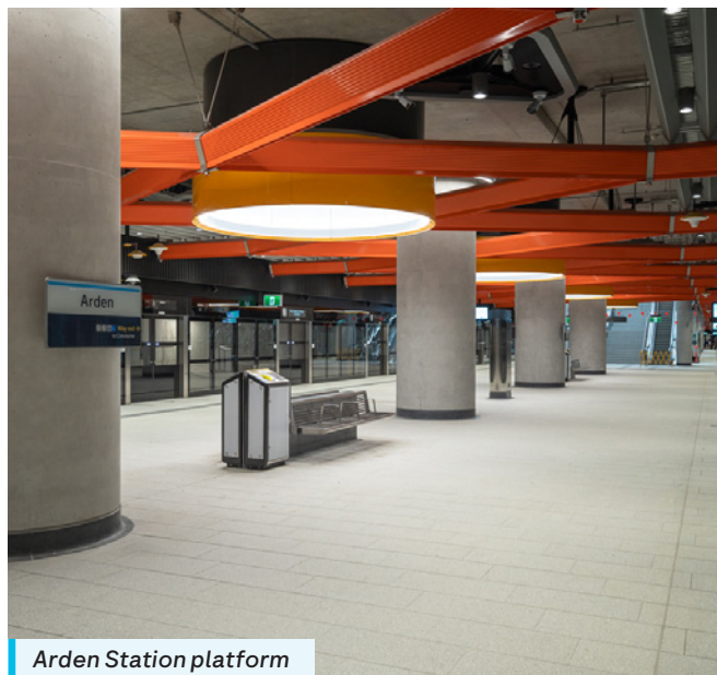
Arden Station platform

24 hour works are sometimes required during peak construction activities