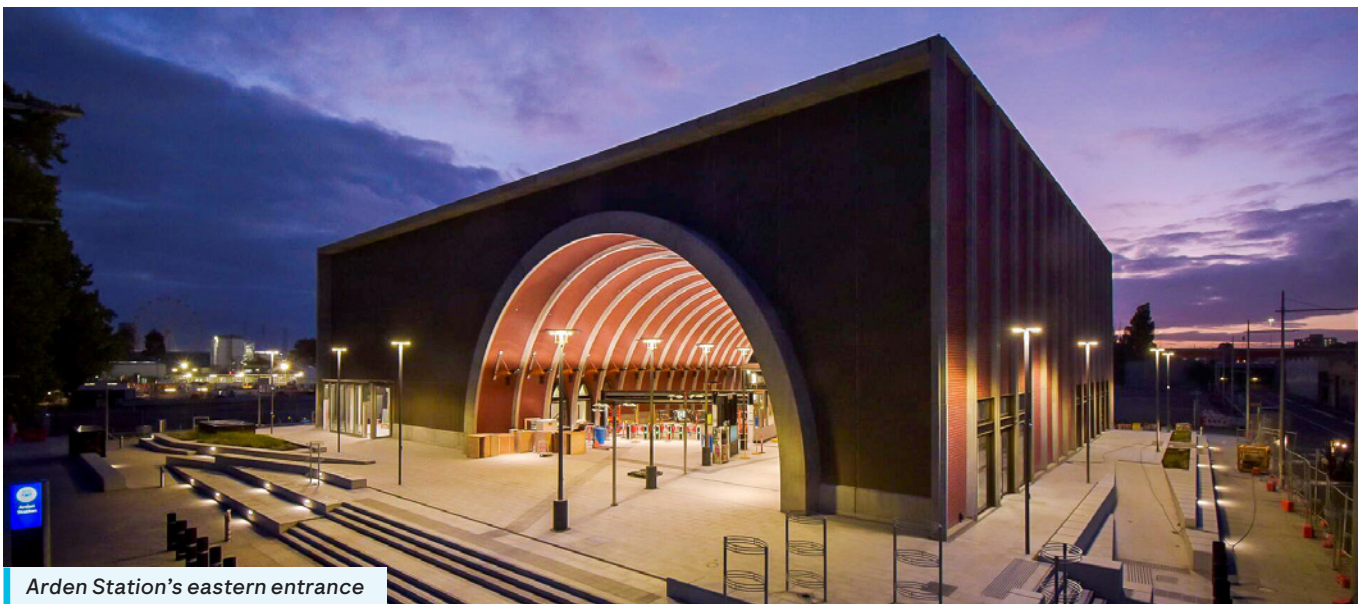
Arden Station's eastern entrance

Further information on these works can be found overleaf or at metrotunnel.vic.gov.au